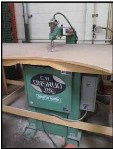
1998 Onsrud mdl. D025 Inverted Router