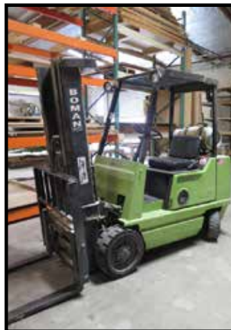
Clark GCX25 4125 Lb Cap LPG Forklift