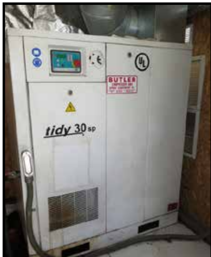
Butler "Tidy 30SP" 30Hp Rotary Air Compressor

Finishing : SZ Spray Zone "Crossfire Semi Down-Draft" mdl. SZ-SDD20SE 201210 Enclosed Spray Booth w/ 14'W x 20'L x 9'H Inside Dimensions, 1,000,000 BTU Direct Gas Fired Heater, (2) 2Hp Exhaust Fans, Fire Suppression System, 12-Element Filtration System.