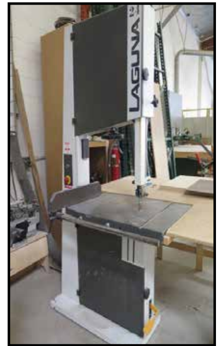
2003 Laguna LT-24 24" Vertical Band Saw