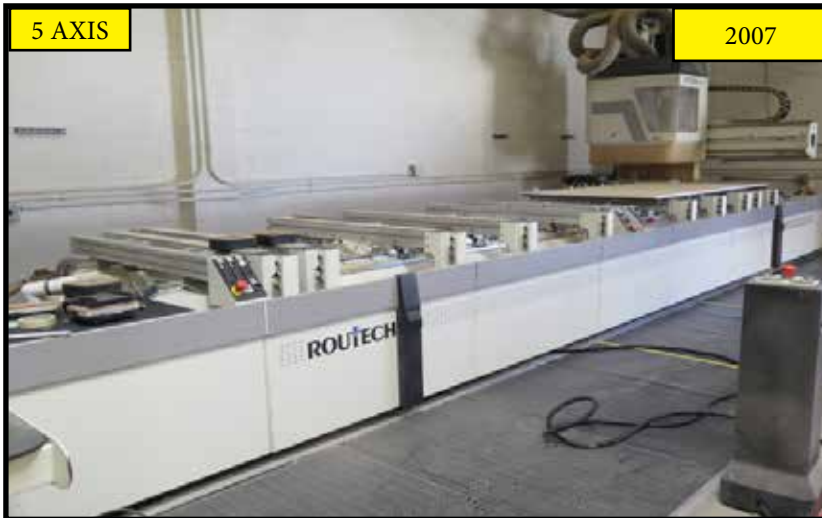
2007 Routech "Action Line" mdl. Record 110 AL PRISMA 5-Axis CNC Router s/n AA1-0162264 w/Routech Routolink PC Based Software and Control Package, 16-Station ATC, HSK-63 Taper Spindle, 49" x245" Work Area, (14) Adjustable Work Supports, Auto Clamping Devises, Vacuum Clamping Fixtures,Becker 7.5kW High Volume Vacuum Pump, Dust Conveyor.