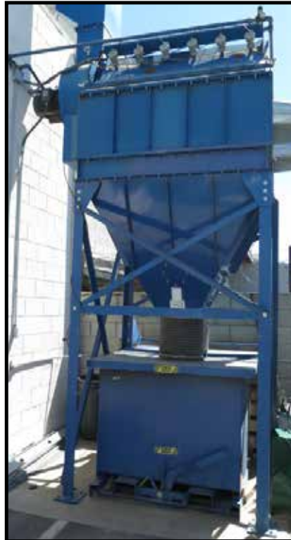
Donaldson Torit "Power Cone" Dust Collection System