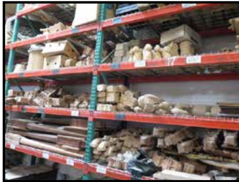
Partial View of Ornamental Woodwork