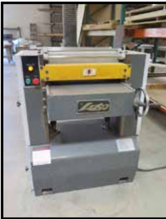
2006 Lobo WP-2000 20" x 7" Planer