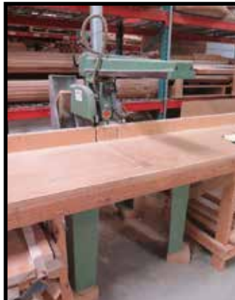
Radial Arm Saw