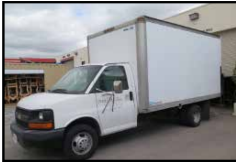
2003 Chevrolet 12' Box Truck Lisc# 7C92540 w/ 6L Gas Engine, Automatic Trans, Tommy Lift Gate, AC, 153,759 Miles, VIN# 1GB-JG31U631100559.