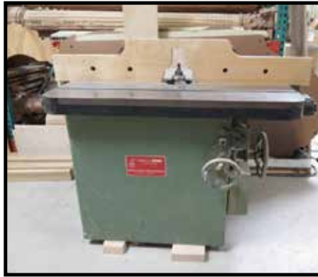
Tegel & Sonner Tilting Arbor Spindle Shaper