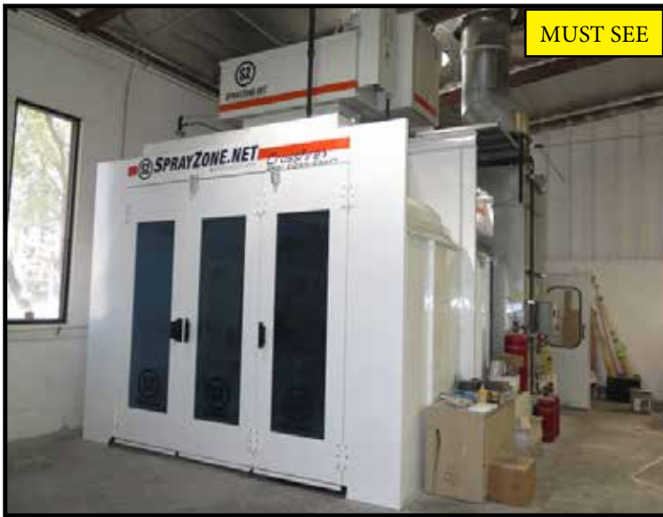
SZ Spray Zone "Crossfire Semi Down-Draft" mdl. SZ-SDD20SE 201210 Enclosed Spray Booth w/14'W x 20'L x 9'H Inside Dimensions