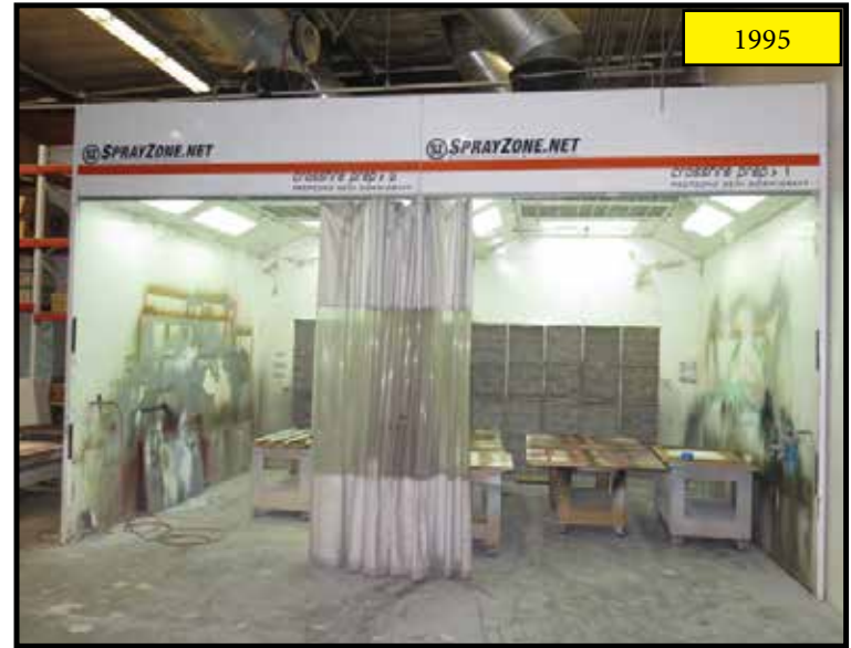
SZ Spray Zone "Crossfire Prezone Semi Down-Draft" mdl. SZ-PSD 20159 Open Face Sprat Booth w/ 20'W x 15'L x 9'H Inside Dimensions