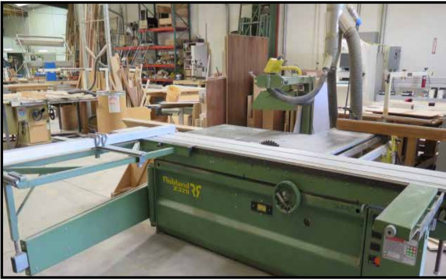
Robland Z320 Sliding Table - Table Saw w/ Tiger Stop Automatic Fence System