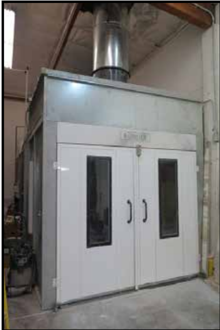
Spray Zone Finishing "Spray-Tech" 10' x 18' (Inside Dimension) Enclosed Spray Booth