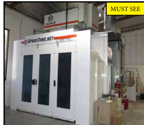
SZ Spray Zone "Crossfire Semi Down-Draft" mdl. SZ-SDD20SE 201210 Enclosed Spray Booth w/14'W x 20'L x 9'H Inside Dimensions