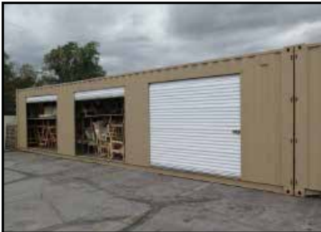
45' and 35' 3-Door Storage Containers.