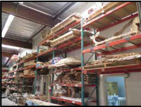
Partial View of Unfinished Furnishings