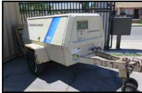
Ingersoll Rand 185/90 Towable Diesel Air Compressor