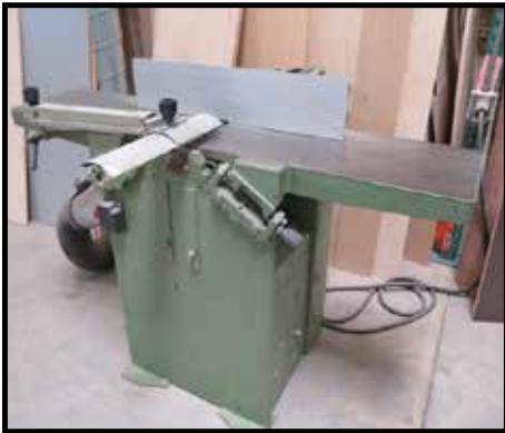
Robland XSD 12" Jointer