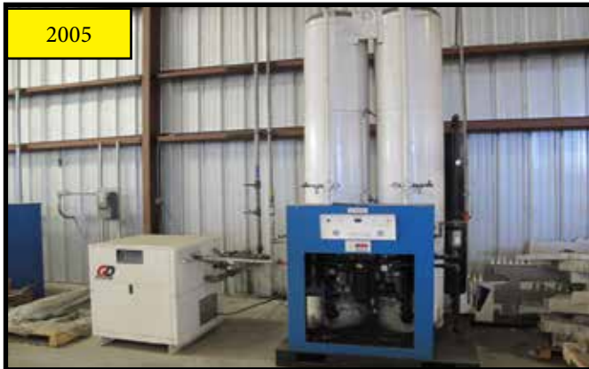
2005 On Site Gas Systems mdl. N-300 O2N2 Nitrogen Generator System s/n 3137 w/ N-Tron mdl. 1000 O2 Analyzer