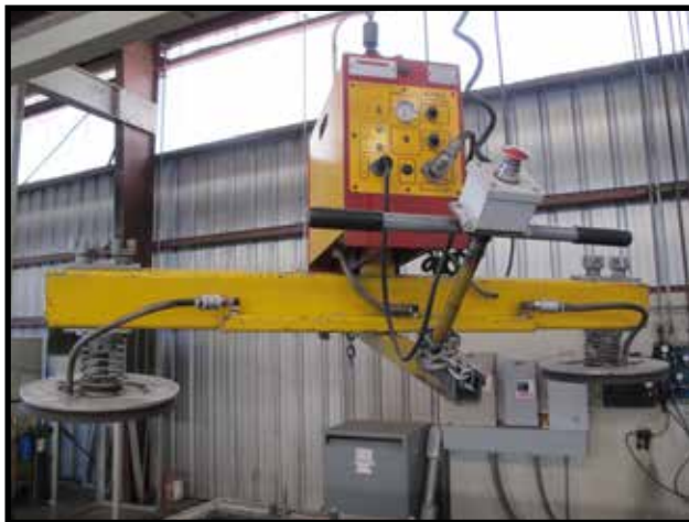
CMCI UNIVAC330 2210 Lb Cap Vacuum Sheet Lift