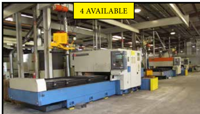
Mitsubishi and Mazak Laser Machines