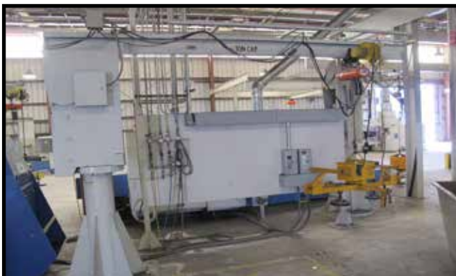
Bushman 1/2 Ton Cap Motorized Floor Mounted Jib w/ CM Loadstar 1/2 Ton Electric Hoist