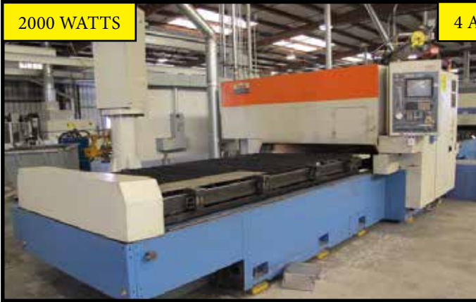
1993 Mazak Super Turbo-X510 Hi-Pro CNC Laser Processing Machine s/n 100812 w/ Mazak L32 Controls, 2000 Watt Laser mdl. CO2 LASER YB2006LB 5M2