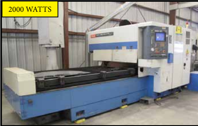
1995 Mazak Super Turbo-X48 Hi-Pro Supercharged CNC Laser Processing Machine s/n 115645 w/ Mazak L32 Controls, 2000 Watt Laser mdl. CO2 LASER YB-L200B 7M6