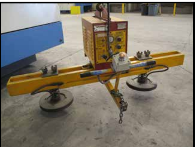
CMCI PUP330 1060 Lb Cap Vacuum Sheet Lift

TERMS OF SALE: CASH OR "CASHIERS" CHECK ONLY. 15% "BUYERS" PREMIUM ON ALL PURCHASES. $200.00 REFUNDABLE CASH DEPOSIT. 25% CASH DEPOSIT TOWARDS ALL PURCHASES. ALL SALES ARE SUBJECT TO CALIFORNIA SALES TAX. THERE WILL BE NO EXCEPTIONS.