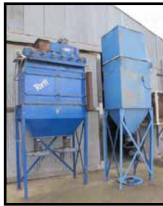
Torit Dust Collectors