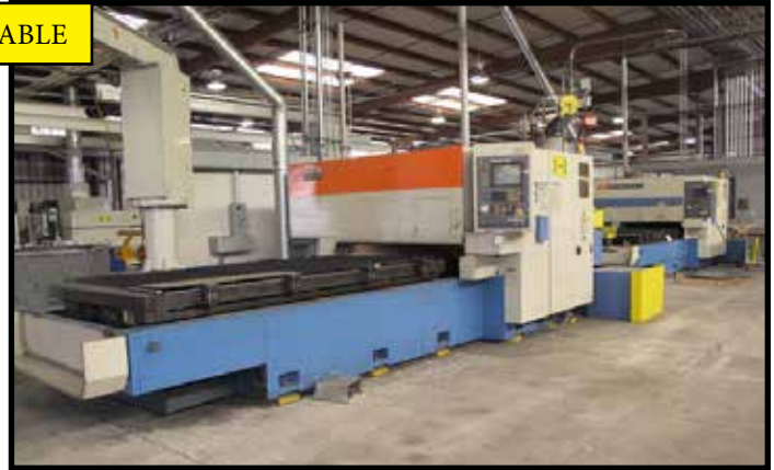
Mazak CNC Laser Machines ***4-AVAILABLE***