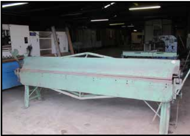
Pexto / Chicago 10' Pan Brake