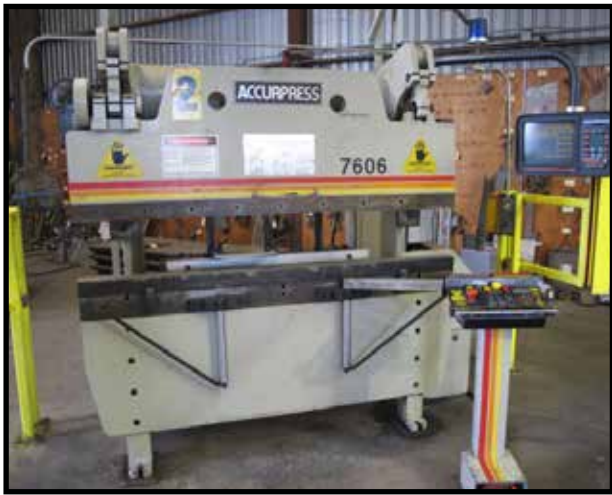
1994 Accurpress mdl. 7606 60 Ton x 6' CNC Hydraulic Press Brake s/n 2448 w/ Accurpress CNC Controls and Gaging System