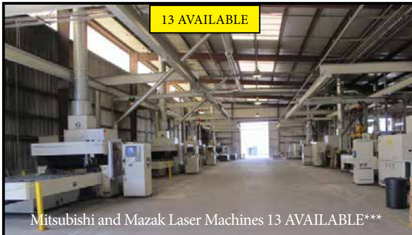
1996 Mitsubishi ML3015HD CNC Laser Processing Machine s/n 1630HD111 w/ Mitsubishi LC10BV Controls, Hand Wheel, 3000 Watt Laser, Mitsubishi ML4030D CO2 Laser Unit and Processing System