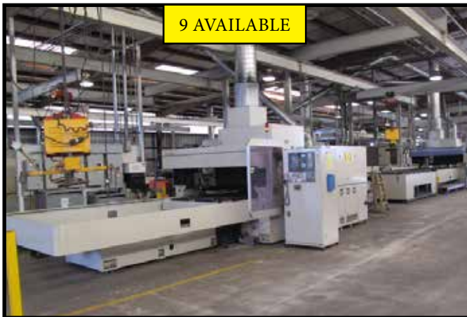
Mitsubishi CNC Laser Processing Machines ***9-AVAILABLE***