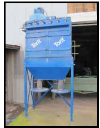
Torit TD-970 Dust Collector ***2-AVAILABLE***