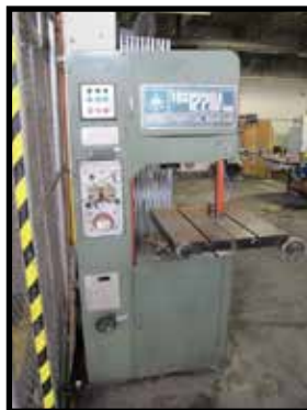
Jet mdl. VBS1220A 20" Vertical Band Saw