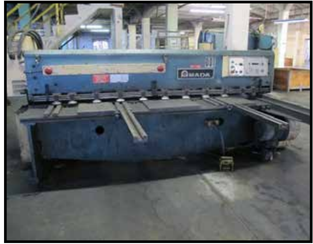
Amada M-2545 8' x .177" Power Shear w/ Amada Controls