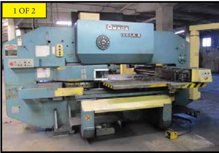
Amada VELA II mdl. VELA II-305050 30-Ton 56-Station CNC Turret Punch Press s/n VII-55363 w/ Amada-Fanuc-V System 6M Controls, 56-Station Turret, Manual Sheet Repositioner, 100" x 50" Ball-Top Table