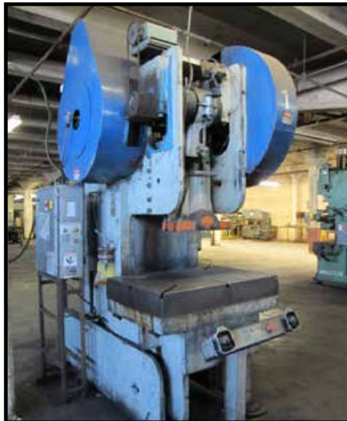
Heim mdl. 12A-OBI-BG 120-Ton Back-Gearred OBI Stamping Press w/ Pneumatic Clutch