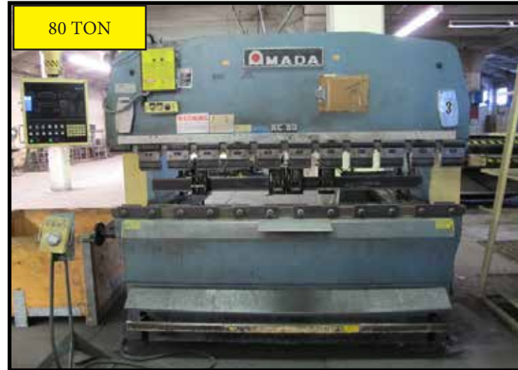
Amada RG-80 80-Ton x 8' CNC Press Brake w/ Amada NC9EX Controls