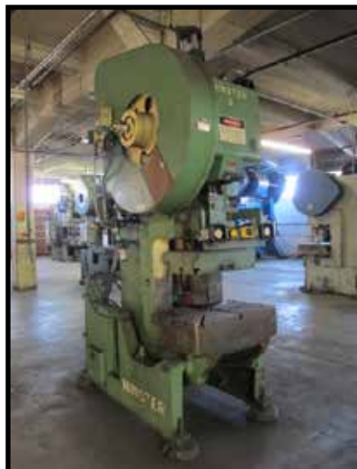
Minster No.6 60-Ton OBI Stamping Press w/ Pneumatic Clutch