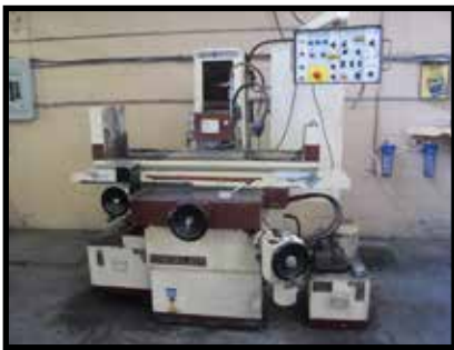
Chevalier FSG-3A818 8" x 18" Automatic Hydraulic Surface Grinder