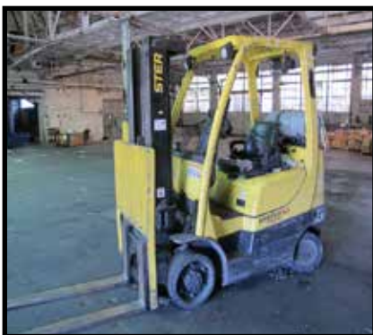
Hyster "50 Fortis" mdl. S50FT 5000 Lb Cap LPG Forklift

Directions : From Oakland Airport, take I-880 North, Exit on 29 th Ave and Keep right. Turn left on E. 10th St. Turn right on Lisbon Ave and keep left onto E. 11 th St. Look for "Auction Today" signs..