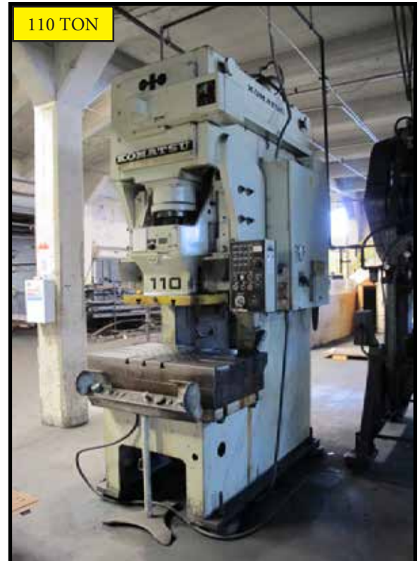
Komatsu OBS110-2 110-Ton Hydraulic Straight Side Press