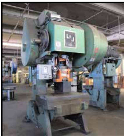
L & J mdl. 100 100-Ton Back-Gearred OBI Stamping Press w/ Pneumatic Clutch