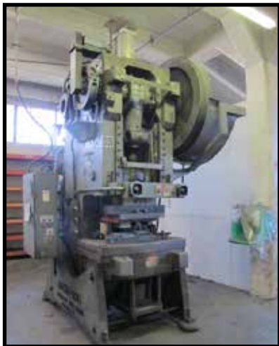
Rockford 8-S OBI Stamping Press w/ Pneumatic Clutch