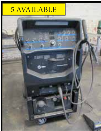
Miller Syncrowave 250DX Welding Power Source ***3-AVAILABLE***