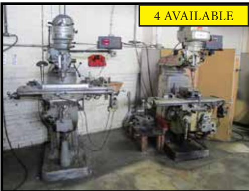
VERTICAL MILLS ***4-AVAILABLE***