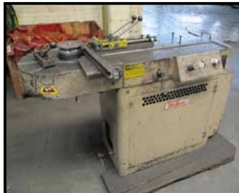
Acro No. 8 Hydraulic Power Bender