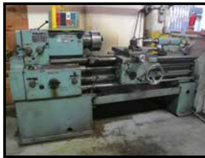
TOS mdl. SN40B Geared Head Lathe