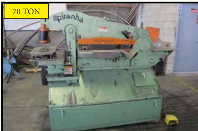
Piranha mdl. P70 70-Ton Iron Worker