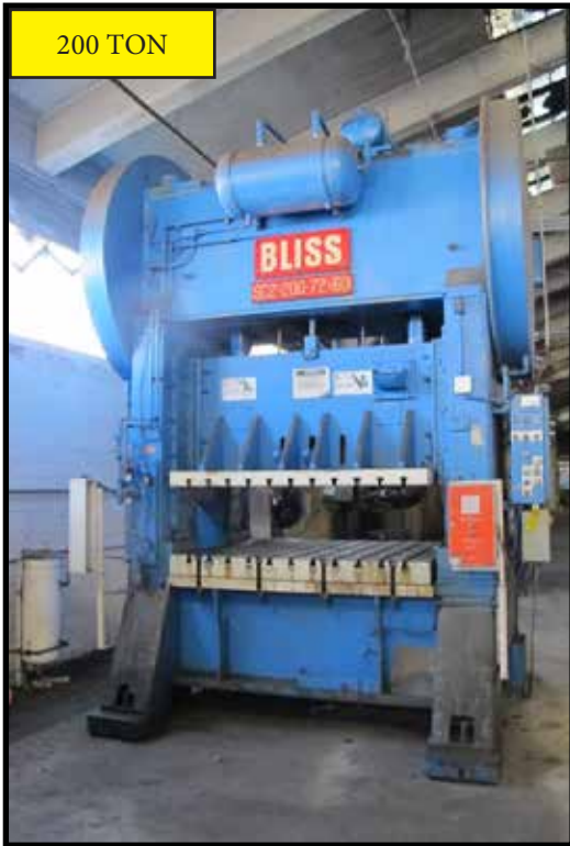
Bliss SC2-200-72X60 200-Ton Straight Side Stamping Press