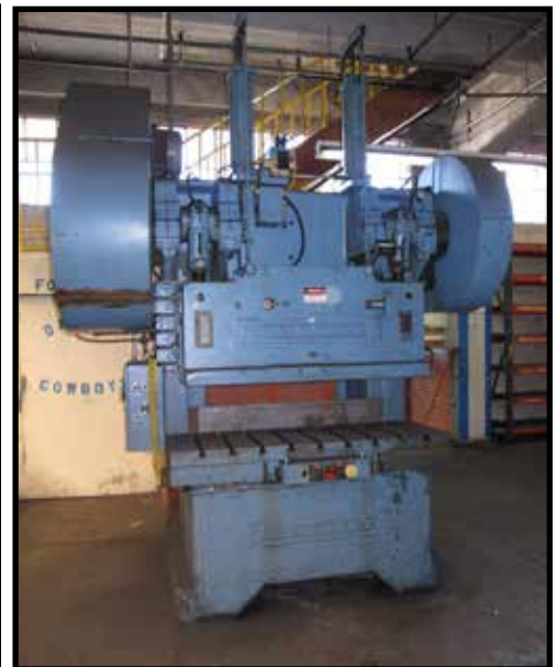
Rousselle 10K60 100-Ton Stamping Press