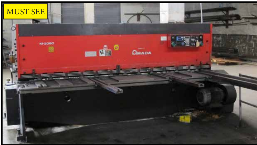
1996 Amada M-3060 1/4" x 10' Power Shear w/ Amada Digital Controlled Back Gaging