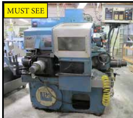
Brown & Sharpe No. 2 1 5/8" Cap. CNC Screw Machine w/ Retromatic Conversions Summit Bandit CNC Controls