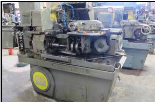
Brown & Sharpe No. 2 1 1/4" Cap. Automatic Screw Machine