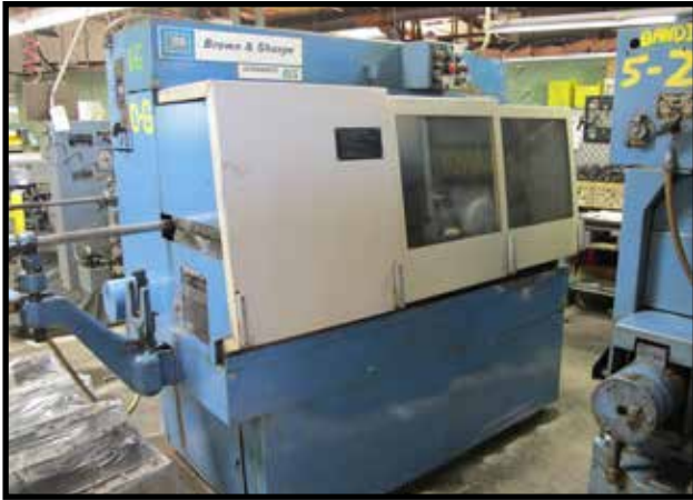
Brown & Sharpe Ultramatic R/S No. 2G 3/4" Cap. Automatic Screw Machine