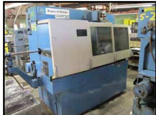
Brown & Sharpe Ultramatic R/S No. 2G 3/4" Cap. Automatic Screw Machine