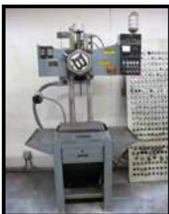
Burgmaster 6-Station Automatic Turret Drill