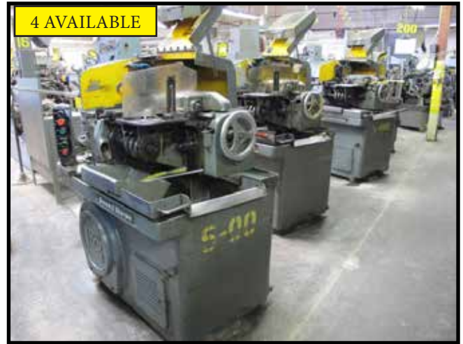
Brown & Sharpe No. 00 1/2" Cap. Automatic Screw Machines