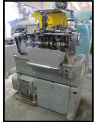
Brown & Sharpe No. 00G 1/2" Cap. Automatic Screw Machine