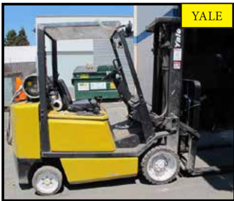
Yale GLC060TGNUAE84A 6000 Lb Cap LPG Forklift