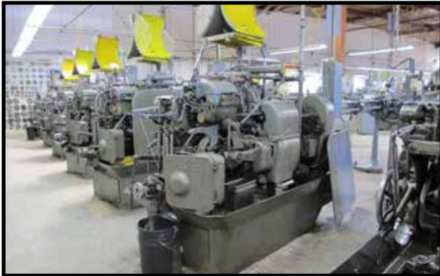
Davenport mdl. B 5-Spindle Automatic Screw Machines