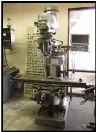
Bridgeport Vertical Mill w/ Futaba DRO