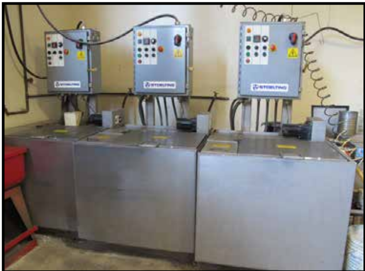
Stoelting mdl. RTW-236 3-Stage Parts Washer