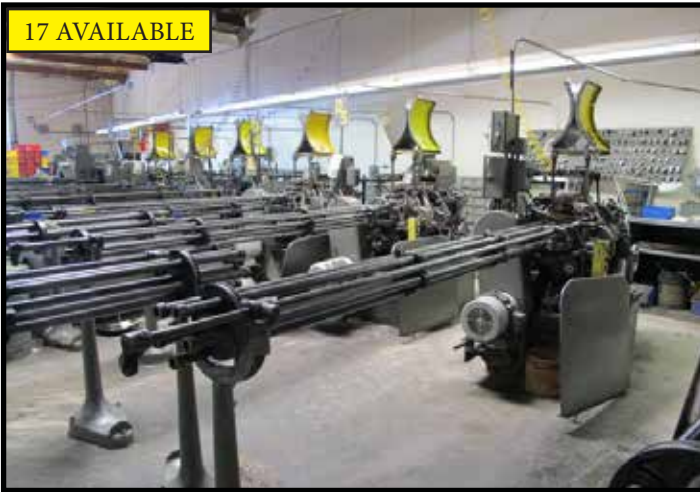
Davenport mdl. B 5-Spindle Automatic Screw Machines w/ Various Attachments