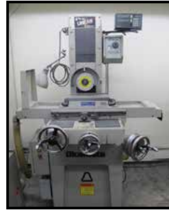
Okamoto "Linear 6-12/14" Surface Grinder w/ Sony DRO