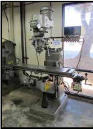
Bridgeport Vertical Mill w/ Sony DRO