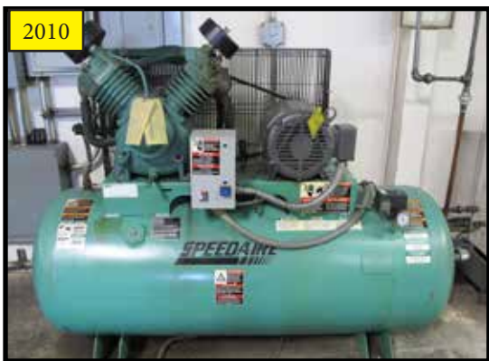
2010 Speedaire 10Hp Horizontal Air Compressor

TERMS OF SALE: CASH OR "CASHERS" CHECK ONLY 15% "BUYER'S" PREMIUM ON ALL PURCHASES. $200.00 REFUNDABLE CASH DEPOSIT. 25% CASH DEPOSIT TOWARDS ALL PURCHASES. ALL SALES ARE SUBJECT TO CALIFORNIA SALES TAX. THERE WILL BE NO EXCEPTIONS.