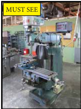
Enco Vertical Mill w/ Enco DRO, 78-4800 RPM, Chrome Box Ways