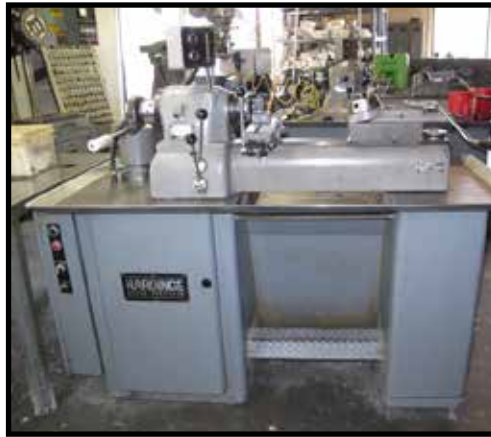
HARDINGE DSM59 SECOND P LATHE