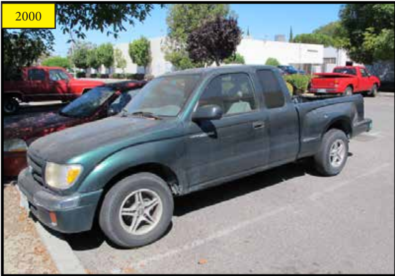
2000 Toyota Tacoma Extended Cab Step-Side Pickup Truck