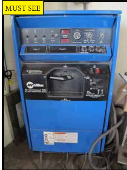
Miller Syncrowave 351 CC-AC/DC Welding Power Source