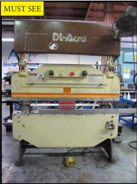
DiAcro mdl. 14-72 14GA x 72" Press Brake