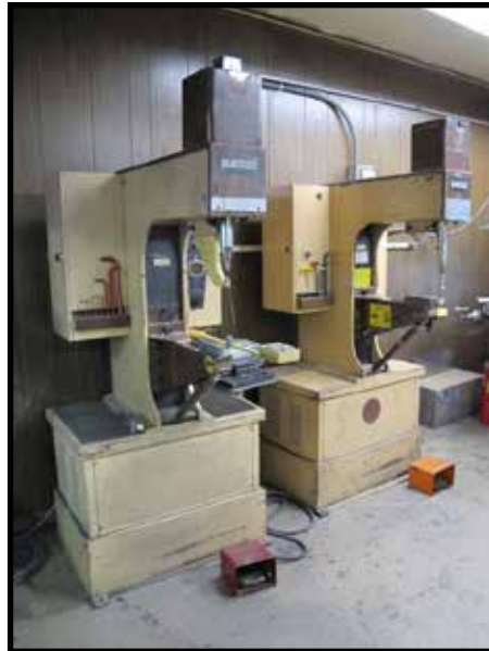
Haeger HP6-B and HP6-C 6 Ton x 18" Hardware Insertion Presses