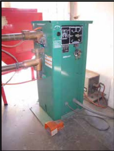
Western Arctronics 50kVA Spot Welder