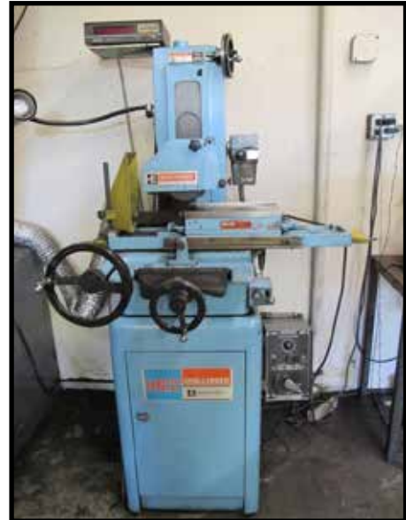
Boyar Schultz Challenger H612 Surface Grinder