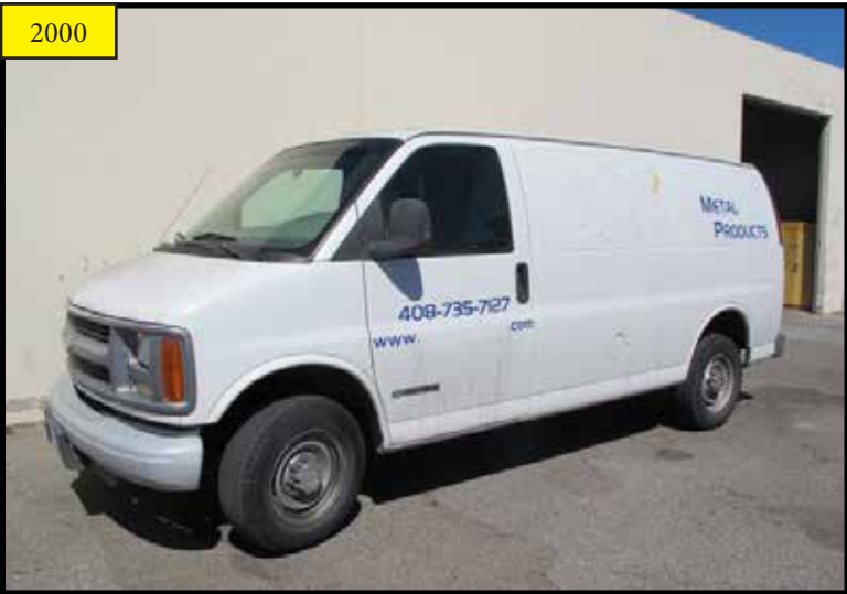
2000 Chevrolet Express 2500 Cargo Van w/ 5.7L Vortec Gas Engine