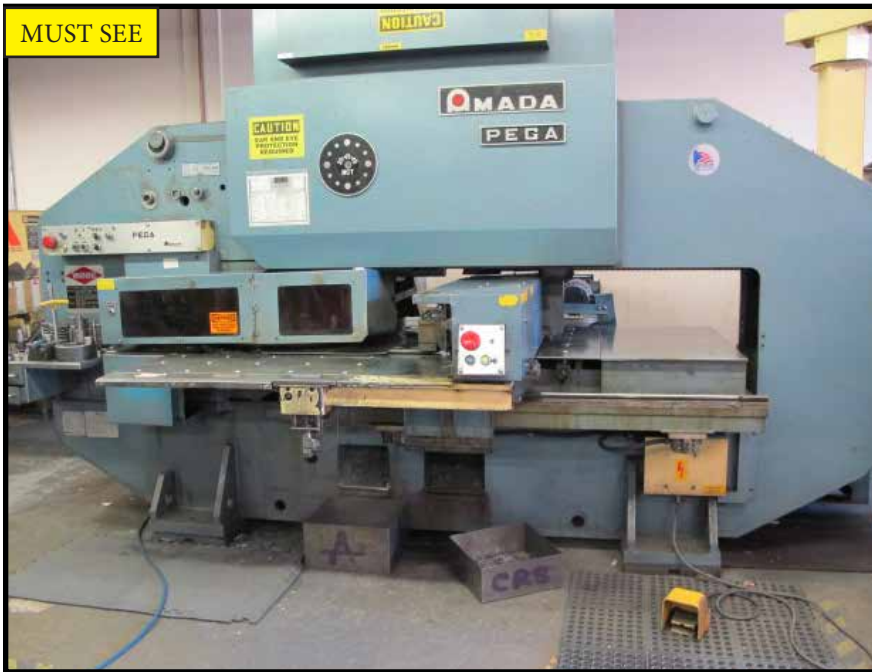
Amada PEGA 304040 30 Ton 40-Station CNC Turret Punch Press w/ Amada-Fanuc-P (System 6M) Controls