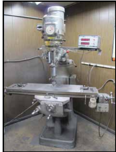
Bridgeport Vertical Mill w/ Sterling DRO