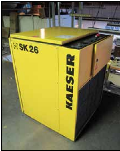
Kaeser SK26 20Hp Rotary Air Compressor