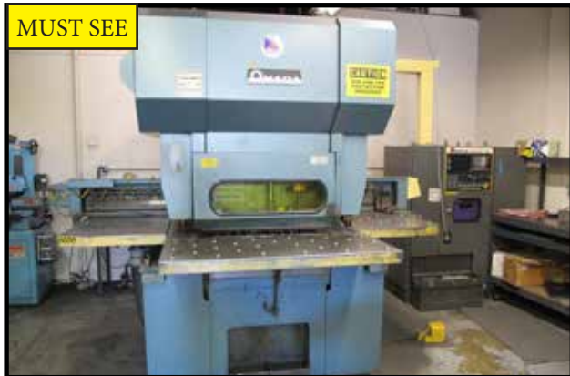
Amada OCTO-334 30 Ton 8-Station CNC Punch Press w/ Amada-Fanuc-O (Series 6M) Controls