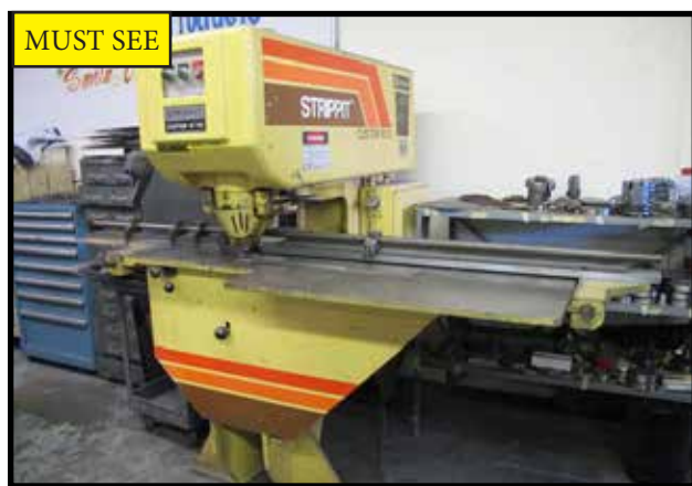
Strippit Custom 18/30 Fabrication Punch Press