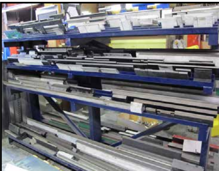
Partial View of Brake Tooling