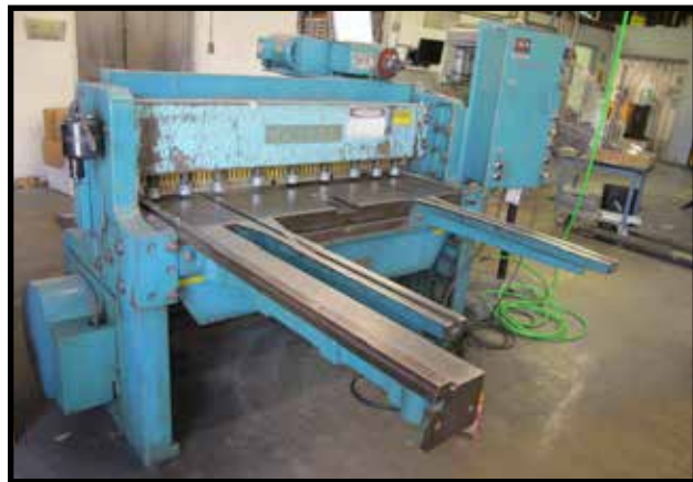
Wysong mdl. 1052 10GA x 52" Power Shear