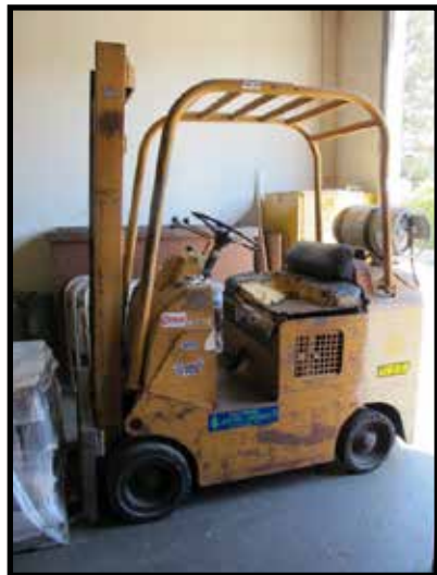
Towmotor 5000 Lb Cap LPG Forklift