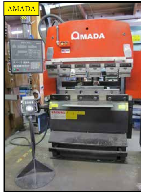
1995 Amada RG-35S 35 Ton x 48" CNC Press Brake w/ Amada NC9-EX II Controls