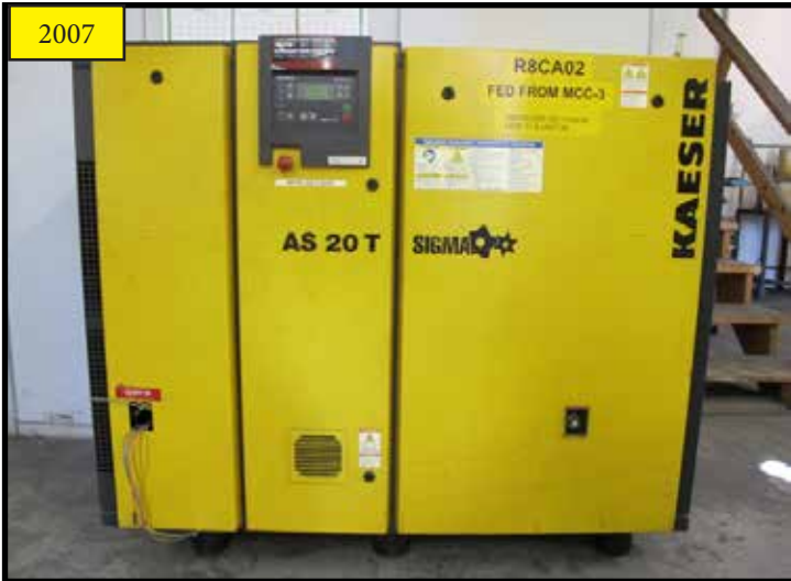
2007 Kaeser AS20T Sigma 20Hp Rotary Air Compressor w/ Sigma Controls