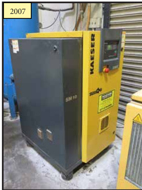
2007 Kaeser SM10 10Hp Rotary Air Compressor