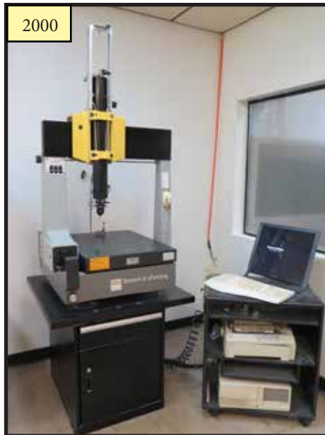
2000 Brown & Sharpe "Gage-2000" CMM Machine w/ Renishaw MIP Probe