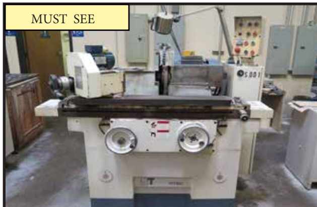
2003 Supertec G20P-45M 10" x 17" Auto Cylindrical Grinder