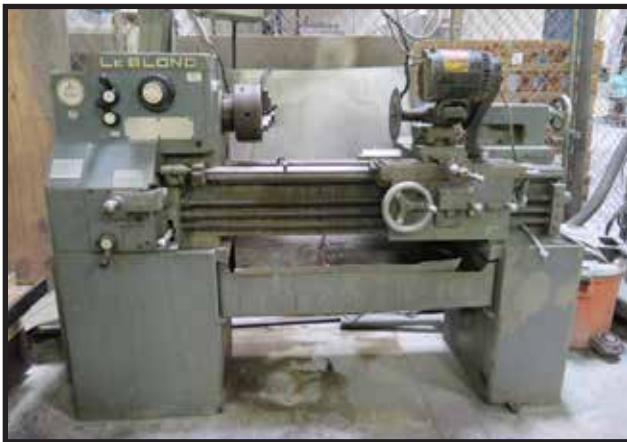
LeBlond Regal 15" x 32" Lathe