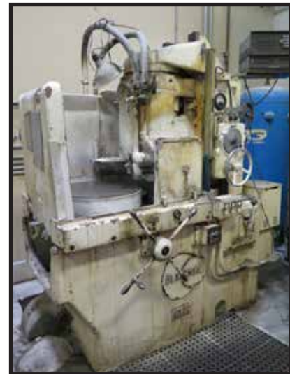
Blanchard No. 11 Rotary Surface Grinder