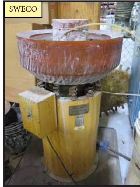
Sweco Media Tumbler

TERMS OF SALE: CASH OR "CASHERS" CHECK ONLY 15% "BUYER'S" PREMIUM ON ALL PURCHASES. $200.00 REFUNDABLE CASH DEPOSIT. 25% CASH DEPOSIT TOWARDS ALL PURCHASES. ALL SALES ARE SUBJECT TO CALIFORNIA SALES TAX. THERE WILL BE NO EXCEPTIONS.