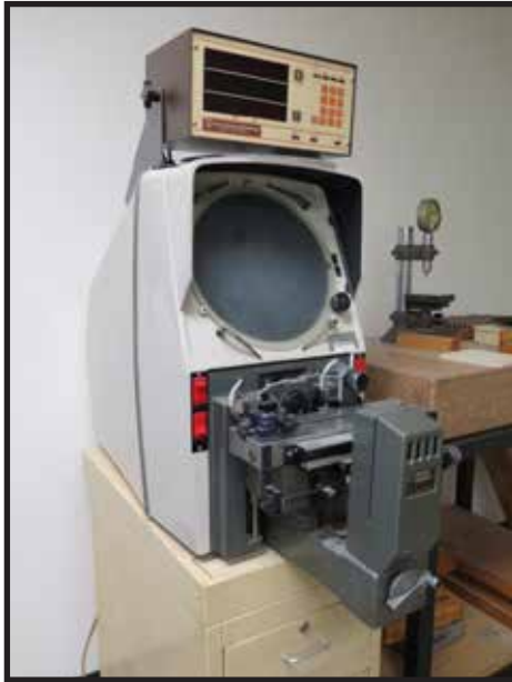
Gage Master "Finite Twenty" 12" Optical Comparator w/ Gage Master DRO