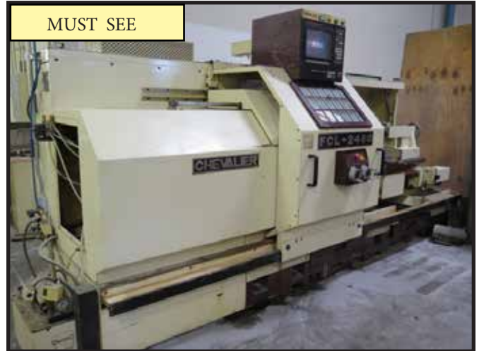
Falcon Chevalier FCL-2460 CNC Lathe w/ Anilam 1200 T-Plus Controls, Tailstock, Tool Post Grinder, Coolant.