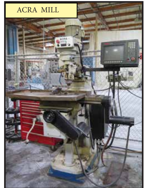
Acra AM-3VAC CNC Vertical Mill w/ Anilam 3200 MK Controls