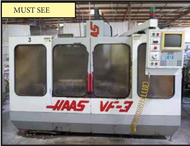
1995 Haas VF-3 CNC Vertical Machining Center