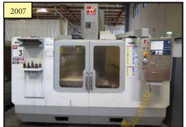
2007 Haas VF-3D CNC Vertical Machining Center