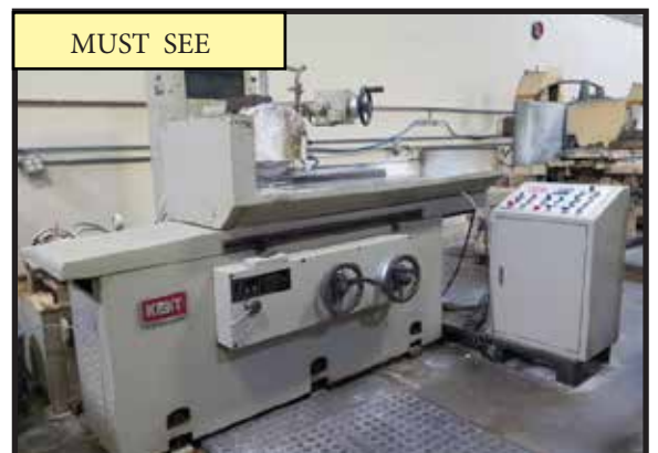
Kent KGS-410AHD 16" x 40" Automatic Hydraulic Surface Grinder