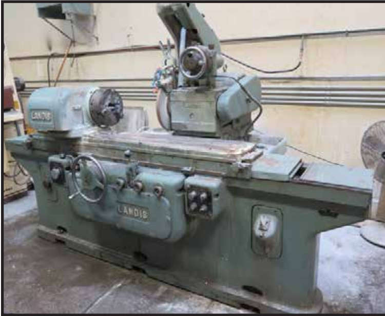
Landis 12" x 36" Automatic Cylindrical Grinder