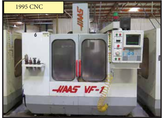
1995 Haas VF-1 CNC Vertical Machining Center