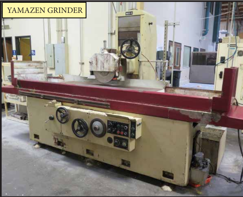
Yamazen / Max-O KGS-500AH 18" x 59" Auto Surface Grinder