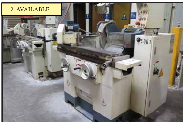
2003 Supertec G20P-45M Auto Cylindrical Grinders ***2-AVAILABLE