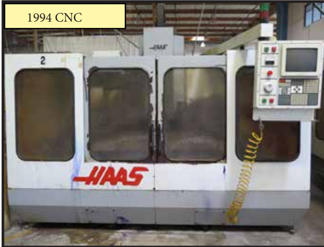
1994 Haas VF-3 CNC Vertical Machining Center