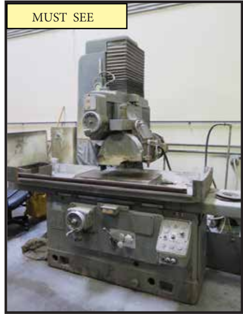
Abawerk Type FFU 750/50 16" x 30" Automatic Surface Grinder