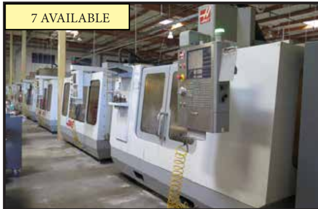
Haas CNC Vertical Machining Centers ***7-AVAILABLE