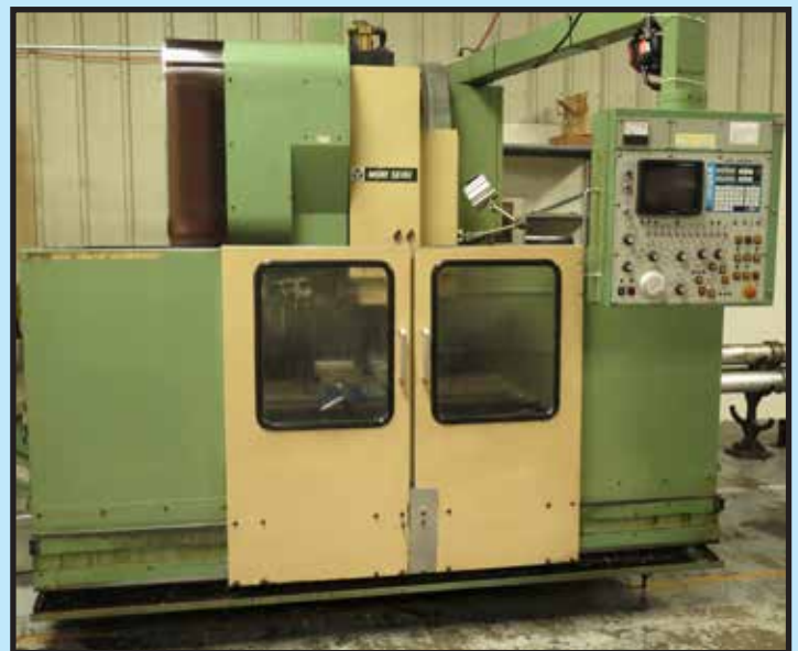
Mori Seiki MV-35/35 CNC VMC with Yasnac Mxi Control, 20 ATC, s/n 240.