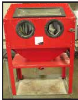
Bead Blast Cabinet.