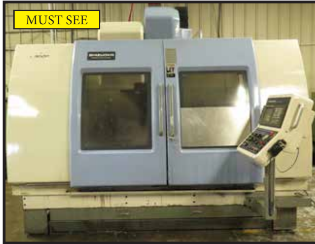
1996 Excel PMC-10T-24 CNC VMC, with Fanuc 21 M control, 8000 RPM, 24 ATC.