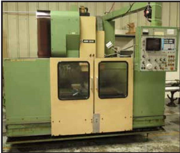
Mori Seiki MV-35/35 CNC VMC with Yasnac Mxi Control, 20 ATC, s/n 240.

Tool Holders, Tooling, Tools and Support