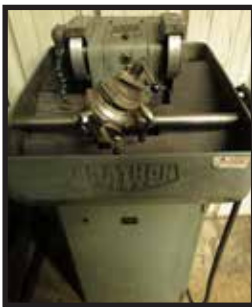
Agathon Diamond tool Grinder.