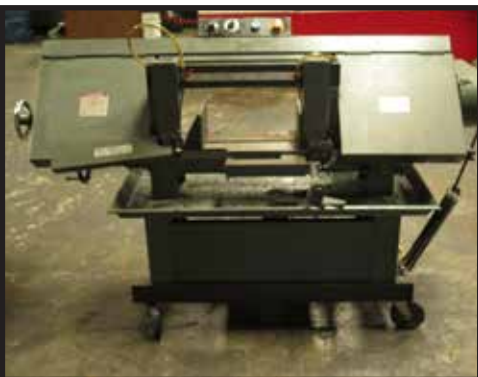
KBC Horizontal Band Saw, 16" round Capacity model 6-271-025.

Directions: From San Jose Airport take I-880 North and exit Fremont Blvd. Turn slight right onto Fremont Blvd, then turn left onto Industrial Drive and turn left onto Industrial Pl.