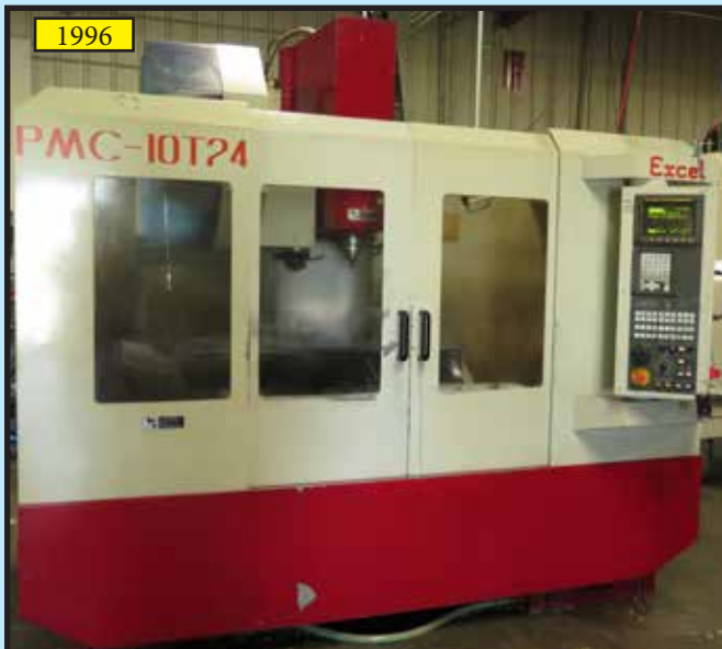
1996 Excel PMC-10T-24 CNC VMC, with Fanuc 21 M control, 8000 RPM, 24 ATC.