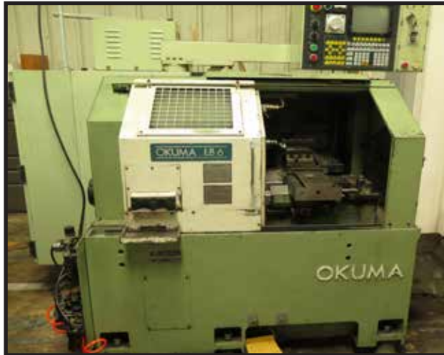
Okuma model LB-6 CNC Gang Type Lathe with 5C collet Chuck, S/N 6201