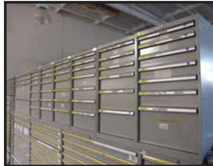
30 LISTA CABINETS, WORK BENCHES, AND TOOL CABINETS.