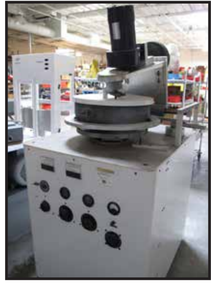
2) VERTICAL LAPPING MACHINES, WITH 19" LAPPING DISC.