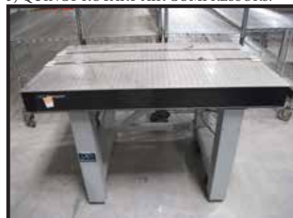
NEWPORT OPTICAL TABLE 3X4