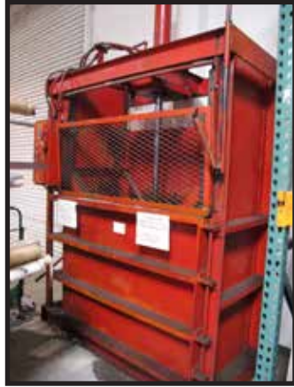
VERTICAL HYD CARDBOARD BAILER.