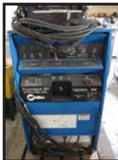
MILLER MIG & TIG WELDER.