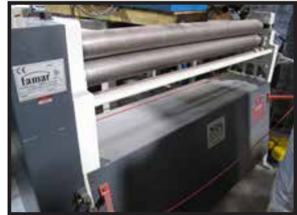
EAGLE FAMAR A39 13/2.5 4FT X 12GA INITIAL PINCH PLATE ROLLS, 3.5" ROLLS.