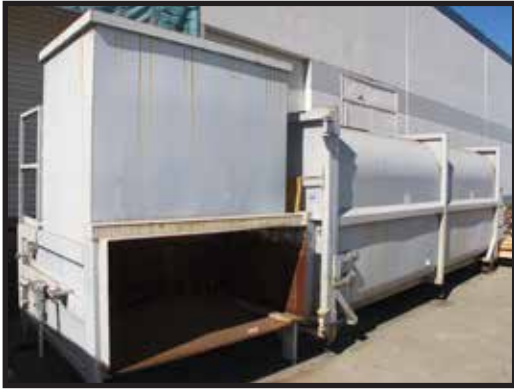
BAY CON HORIZONTAL COMPACTOR, S/N 49525