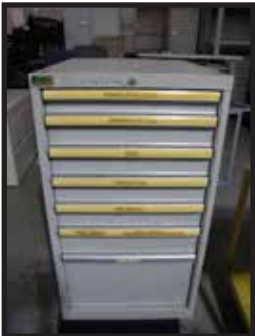
LARGE SELECTION OF INSPECTION TOOLS, MICS, CALIPERS, HEIGHT GAGES.