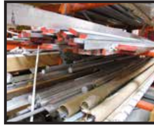
ALUMINIUM PLATE, STOCK, MATERIAL AND FLAT BARS.