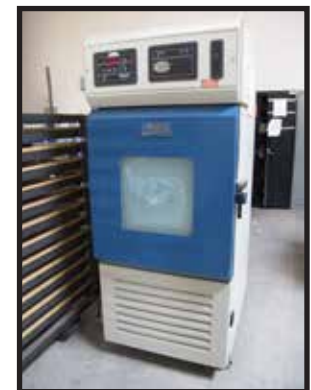
TENNY MODEL T10RS-1.5 ENVIORNENTAL CHAMBER