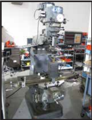
2) SHARP VERTICAL MILLS WITH 3HP, VAR SPEED, CHROME WAYS, ANILAM DRO.