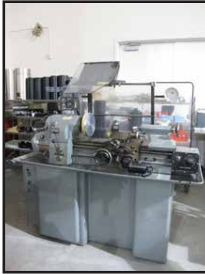
HARDINGE HLV-H TOOL ROOM LATHE WITH THREADING, S/N HLVH-658.