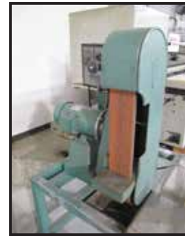
BURR KING SANDER