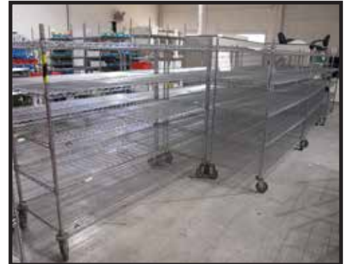
LARGE SECTION OF METAL CARTS