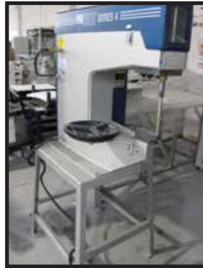
PEMSETTER SERIES 4 HYD INSERTION PRESS, S/N J4-3166.