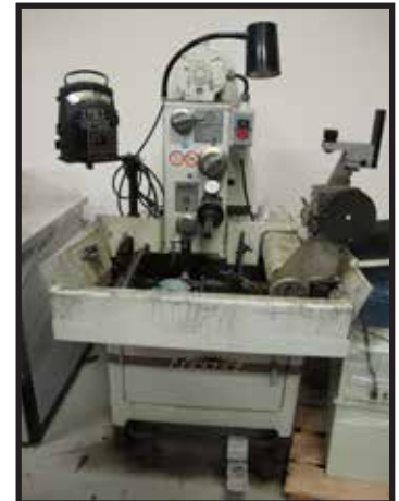
SUNNEN MBB-1660 HONING MACHINE WITH DG-800E GAGE WITH STROKER.