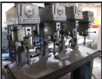
CLAUSING 4 HEAD DRILL PRESS