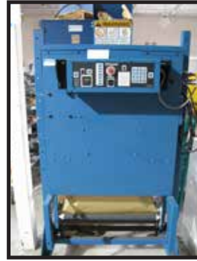
RANPAK-PADPAK PACKING MACHINE W/ELECTRONIC CONTROLS