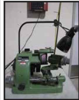
DECKEL S0 TOOL LIP GRINDER