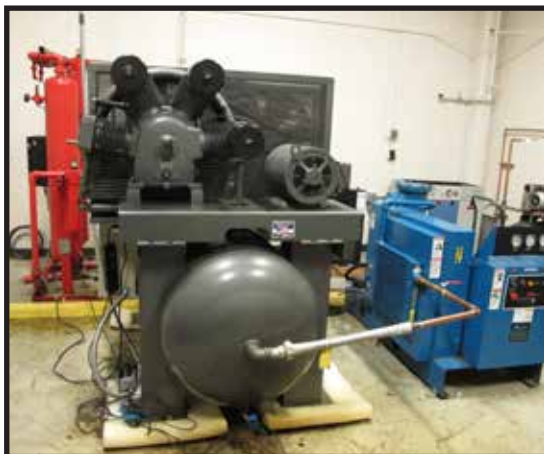
INDUSTRIAL AIR DUAL HEAD, 20HP EACH PISTON AIR COMPRESSOR, MODEL HC20E240H.