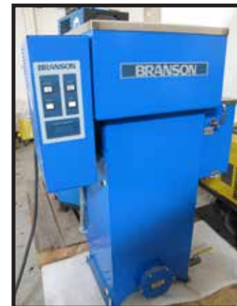
BRANSON ULTRA SONIC CLEANER