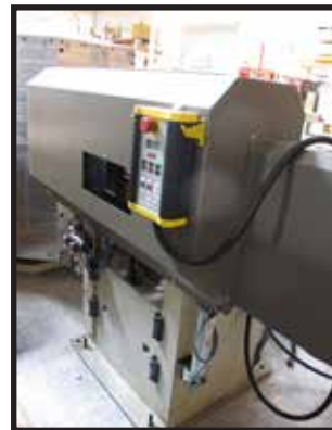
LNS AUTO BAR FEEDER.