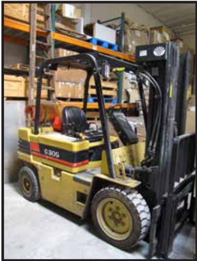
DAEWOO G30S, 6000 LB LPG FORK-LIFT WITH HARD PNEUMATIC TIRES.