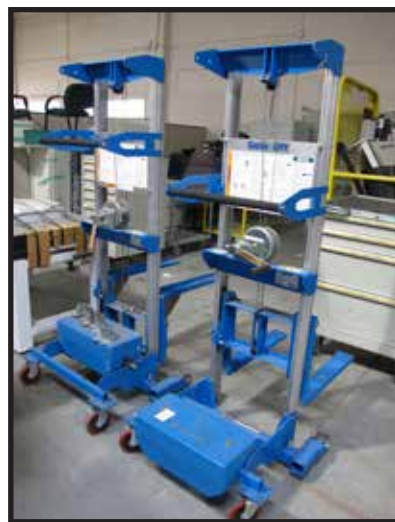
2) GENIE GL-4, 500 LB CAPACITY LIFTS.

LARGE SELECTION OF INSPECTION TOOLS, MICS, CALIPERS, HEIGHT GAGES. OVER 10 SURFACE GRANITE PLATES. LEITZ TOOL MAKERS MICROSCOPE. SPECTRA SCOPE MODEL 201-5167 WITH X Y TABLE. 2) GENIE GL-4, 500 LB CAPACITY LIFTS. BARRETT MODEL EWP40, 4500 ELECTRIC PALLET JACK. RAYMOND STAND UP ELECTRIC FOKLIFT, HOBART CHARGER, SIDE SHIFT, S/N ET-B-96-03412. DAEWOO G30S, 6000 LB LPG FORKLIFT WITH HARD PNEUMATIC TIRES. WEIGH TRONIX FLOOR SCALE WITH DIGITAL READ OUT. 3) QUINCY ROTARY AIR COMPRESSORS. POWEREX 5HP ROTARY SCROLL AIR COMPRESSOR. INDUSTRIAL AIR DUAL HEAD, 20HP EACH PISTON AIR COMPRESSOR, MODEL HC20E240H. ZANDER ECODRY AIR DRYER MODEL KNIZ-EC. ALUMINIUM PLATE, STOCK, MATERIAL AND FLAT BARS. LARGE SELECTION OF RACKING, FLAMMABLE CABINETS AND SHELVING. BAY CON HORIZONTAL COMPACTOR, S/N 49525 VERTICAL HYD CARDBOARD BAILER.