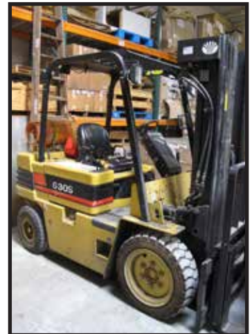
DAEWOO G30S, 6000 LB LPG FORKLIFT WITH HARD PNEUMATIC TIRES.