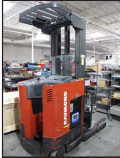
RAYMOND STAND UP ELECTRIC FOKLIFT, HOBART CHARGER, SIDE SHIFT, S/N ET-B-96-03412.