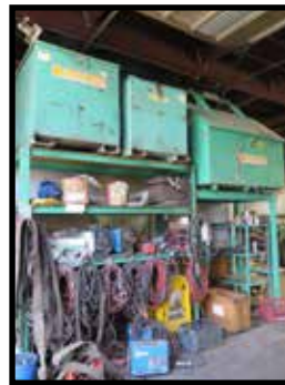
Job Boxes and Welding Accessories