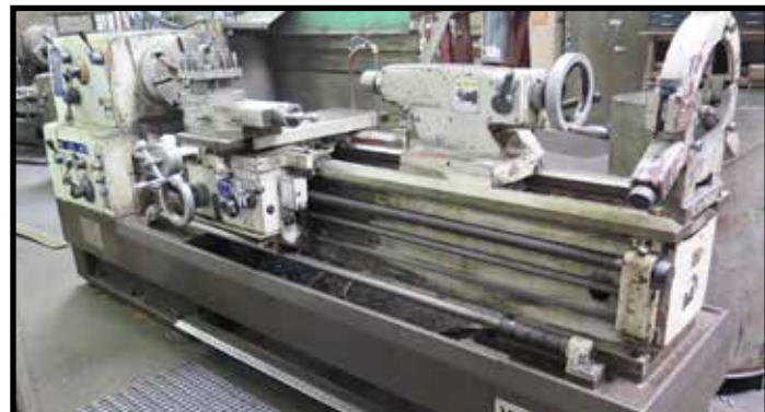
Victor mdl. 2060S 20" x 60" Geared Head Gap Bed Lathe w/ Newall C80 Programmable DRO, 20-1550 RPM, Inch/mm Threading, Tailstock, Steady Rest