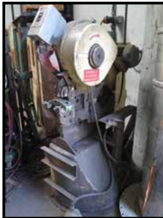
Mubea size BF10F Iron Worker