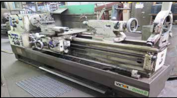
Victor mdl. 2060S 20" x 60" Geared Head Gap Bed Lathe w/ Newall C80 Programmable DRO, 20-1550 RPM, Inch/mm Threading, Tailstock, Steady Rest