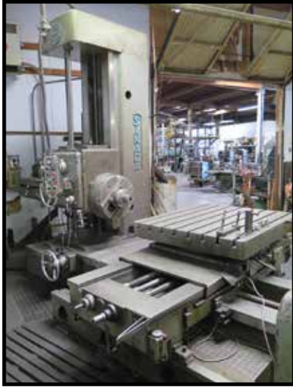
Sinada mdl. SB-100 5-Axis Horizontal Boring Mill s/n 198 w/ SWI Trak 103 3-Axis DRO, 9.5-1000 RPM, 20" Boring Head, 2.75" Spindle, 43 1/2" x 51 1/2" Table