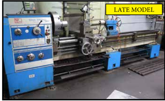
Knuth Sinus 330/3000 26" x 118" Geared Head Gap Bed Lathe s/n 05021025 w/ Knuth Programmable DRO, 9-1600 RPM, Inch/mm Threading, Tailstock, Steady Rest, 20" 4-Jaw Chuck