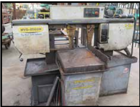
Hyd-Mech mdl. S-20 Series II 13" Hydraulic Horizontal Miter Band Saw

Cadillac mdl. 2260 22" x 68" Geared Head Lathe s/n 060110 w/ 25-1500 RPM, Inch Threading, Tailstock, Steady Rest, KDK Tool Post, 12" 3-Jaw Chuc