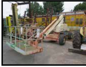
JLG mdl. 40F 40' Extendable Boom Platform Lift