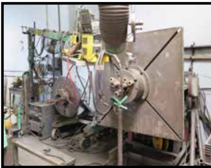
Large Capacity Welding Positioners