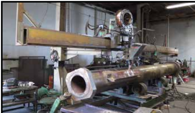
Large Capacity Submerged-Arc Track Welding System w/ Approx 18' Length Cap, Power Rolls, Lincoln Idealarc R3S-800 Arc Welding Power Source, Lincoln NA-3N Auto Wire Feeder, Bin Hopper