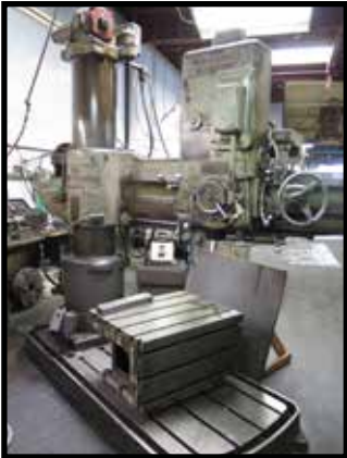
Cincinnati Bickford "Super Service Radial" 15" Column x 48" Radial Arm Drill