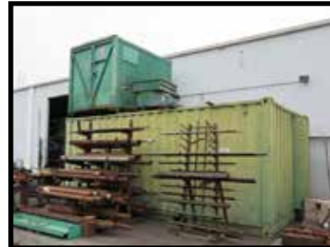
Storage Containers and Racking