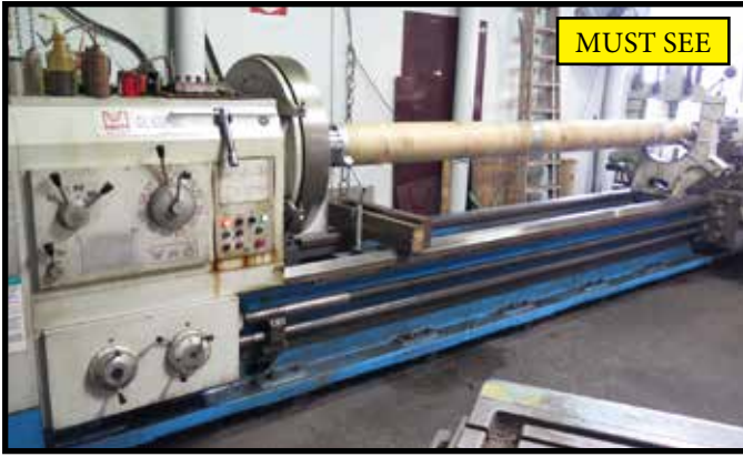
Knuth mdl. DL620/5000 Heavy 49" x 197" Geared Head Gap Bed Lathe w/ Knuth Programmable DRO, 4-315 RPM, Inch/mm Threading, Tailstock, Steady Rest, 40" 4-Jaw Chuck