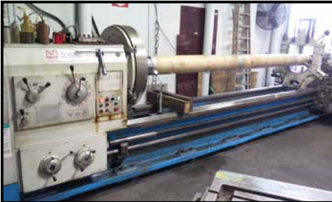
Knuth mdl. DL620/5000 Heavy 49" x 197" Geared Head Gap Bed Lathe w/ Knuth Programmable DRO, 4-315 RPM, Inch/mm Threading, Tailstock, Steady Rest, 40" 4-Jaw Chuck