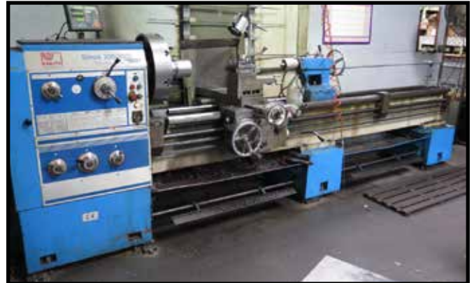
Knuth Sinus 330/3000 26" x 118" Geared Head Gap Bed Lathe s/n 05021025 w/ Knuth Programmable DRO, 9-1600 RPM, Inch/mm Threading, Tailstock, Steady Rest, 20" 4-Jaw Chuck