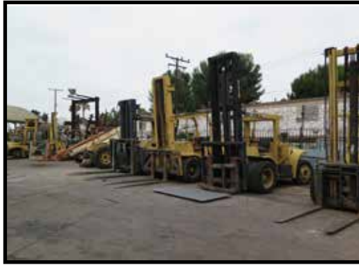
Partial View of Forklifts