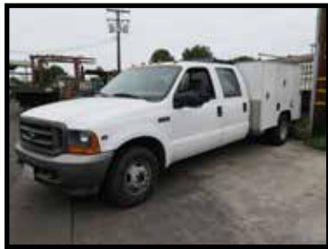
2001 Ford F-350XL Super Duty Crew Cab Utility Truck Lisc# 68637P1 w/ Triton V1- Gas Engine, Automatic Trans