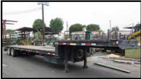
Step Deck Semi Trailer Lisc# UT2428 w/ Rear Ramps