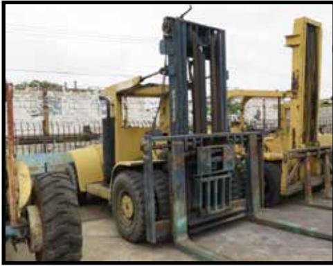
Hyster mdl. H300A 27,700Lb Cap Diesel Forklift s/n A19P-2309X w/ 2-Stage Tall Mast @ 144" Lift Height, Adjustable Forks, Pneumatic Tires