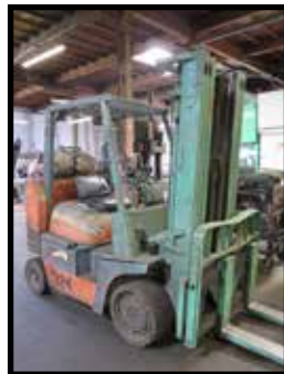
Toyota mdl. 7FGCU35-BCS 6850 Lb Cap LPG Forklift s/n 60359 w/ 3-Stage Mast @ 199" Lift Height