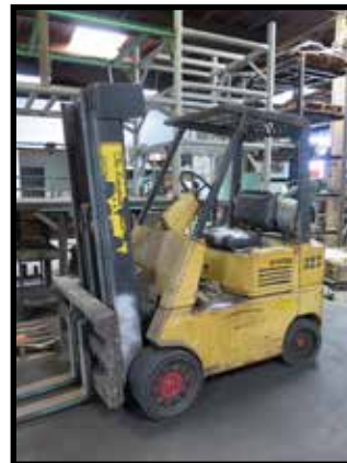
Hyster 4700 Lb Cap LPG Forklift w/ 3-Stage Mast @ 167" Lift Height