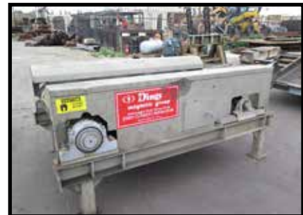
Dings mdl. 9536 Rare Earth Eddy Current Magnetic Separator