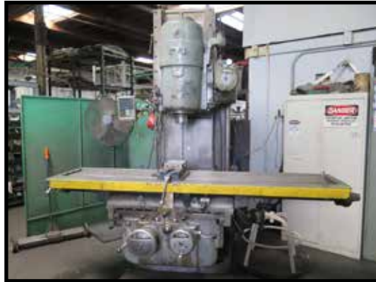
Cincinnati No.5 Vertical Mill s/n 4J5V1Z-25 w/ Newall DRO, 14-1400 RPM, 50-Taper Spindle