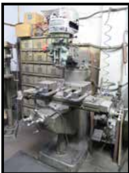
Bridgeport Vertical Mill s/n 63476