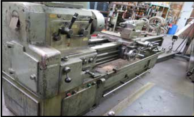
Cadillac mdl. 2260 22" x 68" Geared Head Lathe s/n 060110 w/ 25-1500 RPM, Inch Threading, Tailstock, Steady Rest