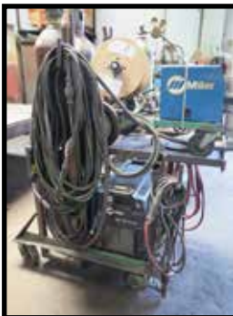
(6) Miller XMT350 CC/CV Auto-Line Welding Power Sources