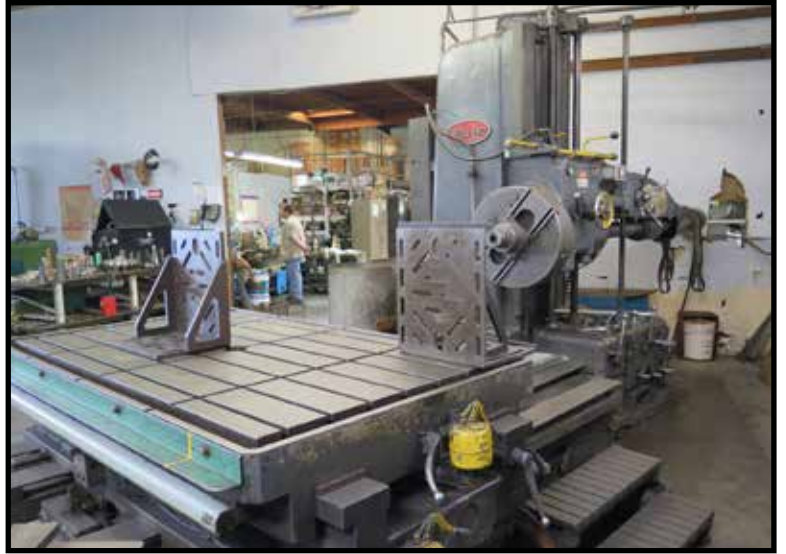
Bullard 4-Axis Horizontal Boring Mill s/n 29114 w/ 7-850 RPM, 50-Taper Spindle, 26" Boring Head, 36" Quill Travel, 49" x 80" Table