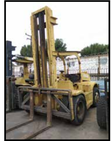
Hyster 18,000 Lb Cap Diesel Forklift