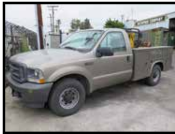
2004 Ford F-250XL Super Duty Utility Truck Lisc# 87237S1 w/ V8 Gas Engine, Automatic Trans