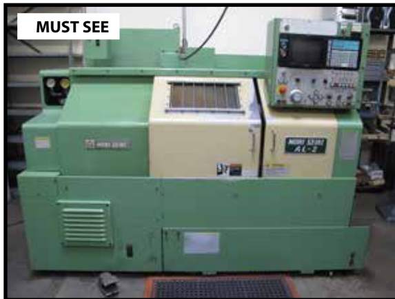
MUST SEE MORI SEIKI MODEL AL-2 CNC LATHE, WITH YASNAC CONTROL, 6" CHUCK, TAILSTOCK, 12 POSITION TURRET, S/N 1561.