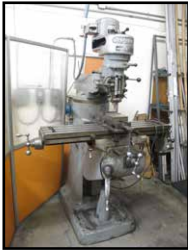
BRIDGEPORT VERTICAL MILL WITH P.F. TABLE, 1HP, J HEAD.