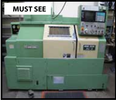
MUST SEE MORI SEIKI MODEL AL-2 CNC LATHE, WITH YASNAC CONTROL, 6" CHUCK, TAILSTOCK, 12 POSITION TURRET, S/N 1561.