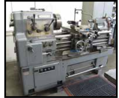
MORI SEIKI MS-850, 17" X 32" ENGINE LATHE, WITH 5C COLLET CLOSER.