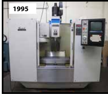
1995 FADAL MODEL VMC-3016 CNC VMC, CT-40 TAPER, 20 ATC, CNC88HS CONTROL, S/N 9502107.