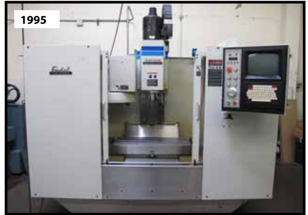
1995 1995 FADAL MODEL VMC-3016 CNC VMC, CT-40 TAPER, 20 ATC, CNC88HS CONTROL, S/N 9502107.