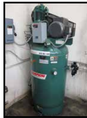
CHAMPION 5HP VERTICAL AIR COMPRESSOR.