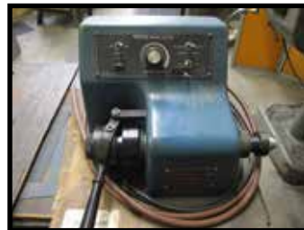
TWISTER SPEED LATHE