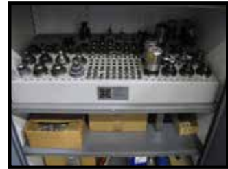
CT-40 TOOL HOLDERS AND SPRING COLLETS