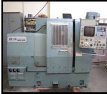
MORI SEIKI MODEL SL-1A CNC LATHE WITH YASNAC CONTROL, 6" CHUCK, TAILSTOCK, 12 POSITION TURRET.