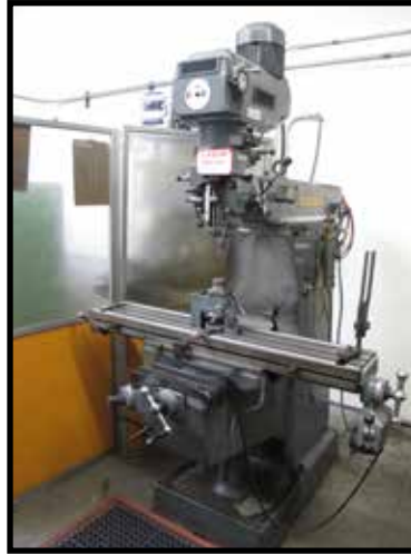
LAGUN FTV-2 VERTICAL MILL, WITH P.F. TABLE, 9 X 48 TABLE.