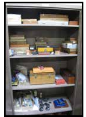
PARTIAL VIEW OF INSPECTION TOOLS