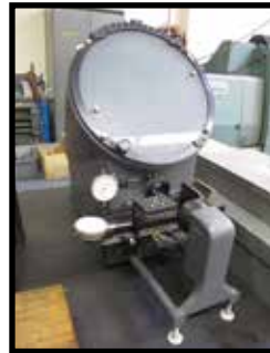
MICRO VU 10" COMPARATOR.