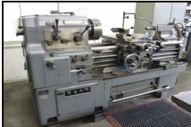
MORI SEIKI MS-850, 17" X 32" ENGINE LATHE, WITH 5C COLLET CLOSER.