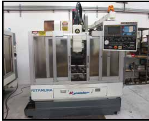
KITAMURA MYCENTER 1 CNC VMC, WITH FANUC O-M CONTROL, 10,000 RPM, 20 ATC, 19" X 14" X 16" (XYZ), S/N 02697.