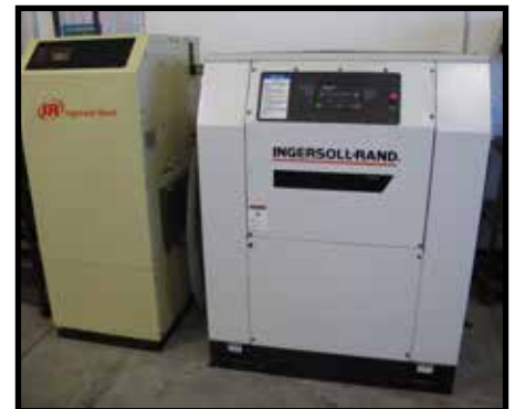
INGERSOLL RAND 40 HP ROTARY AIR COMPRESSOR WITH AIR DRYER AND TANK.