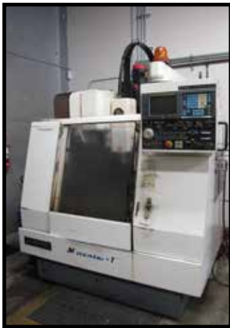
KITAMURA MYCENTER 4 CNC VMC W FANUC 0-M CONTROL, 10,000 RPM, 20 POSITION SWING ARM ATC, 44.3" X 22.2" X 22.5" (XYZ), 40 TAPER, S/N 30637.