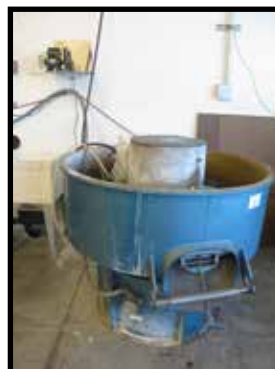
SWEECO 48" VIBRATORY TUMBLER WITH CONTROLS.