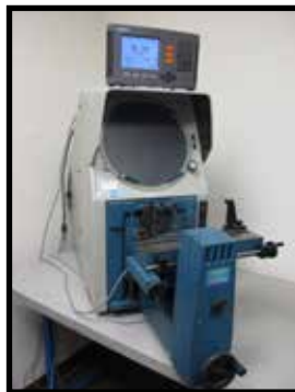
DELTRONICS 14" OPTICAL COMPARATOR WITH HEIDENHAIN CONTROLS.