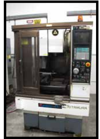
KITAMURA MYCENTER 0 CNC VMC, 16 ATC, 8000 RPM, 12" X 10" X 12" (XYZ), S/N 01016.