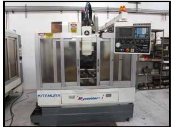
KITAMURA MYCENTER 1 CNC VMC, WITH FANUC O-M CONTROL, 10,000 RPM, 20 ATC, 19" X 14" X 16" (XYZ), S/N 02697.

FROM SAN JOSE INT AIRPORT TAKE US-101 SOUTH AND EXIT DUNNE AVE, TURN RIGHT ONTO DUNNE AVE, AND TURN LEFT ONTO JOLEEN WAY