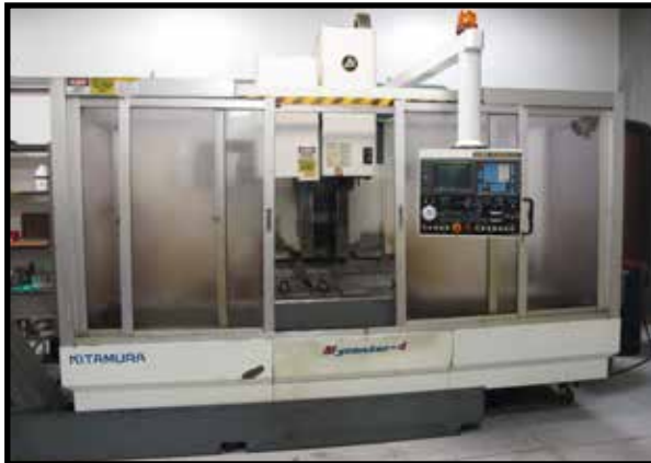
KITAMURA MYCENTER 4 CNC VMC W FANUC O-M CONTROL, 10,000 RPM, 20 POSITION SWING ARM ATC, 44.3" X 22.2" X 22.5" (XYZ), 40 TAPER, S/N 30637.