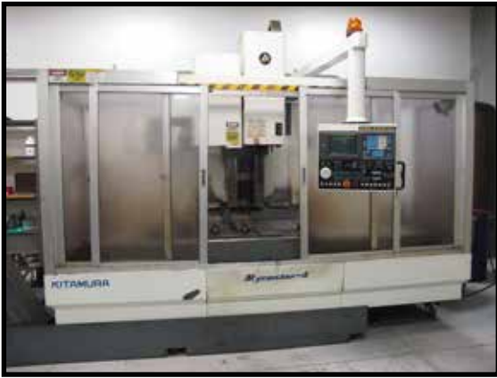
KITAMURA MYCENTER 4 CNC VMC W FANUC 0-M CONTROL, 10,000 RPM, 20 POSITION SWING ARM ATC, 44.3" X 22.2" X 22.5" (XYZ), 40 TAPER, S/N 30637.