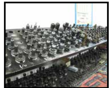
LARGE SELECTION OF KURT VISES, TOOL HOLDERS AND SUPPORT.