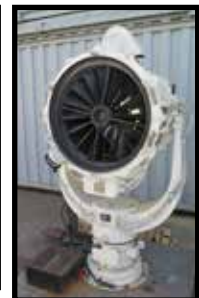
GE Carbide Flood Light