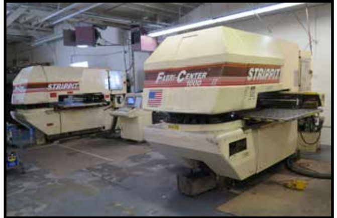
Strippit Fabri-Center 1000 II mdl. FC1000 XP II 22.5-Metric Ton x 20-Station CNC Turret Punch Press s/n 079122094 w/ Macintosh Computer Controls,