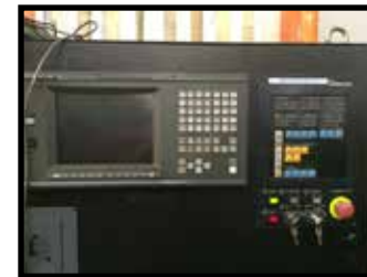
2000 Amada Vipros QUEEN 33-Ton 58-Station CNC Turret Punch Press s/n AVU57187 w/ Fanuc 18-PC Controls, (2) Auto Indexing Stations, 50" x 72" Travels, 50" x 144" Max Sheet Size,

CNC Mill : 1993 Fadal VMC2216HT CNC Vertical Machining Center s/n 9303144 w/ Fadal CNC88HS Controls, 21-Station ATC, CAT-40 Spindle, 4 Meg Memory Expansion, Rigid Tapping, High Speed CPU, Graphics, Servo Coolant, 4th Axis Prewire 16" x 39 1/2" Table, Coolant.