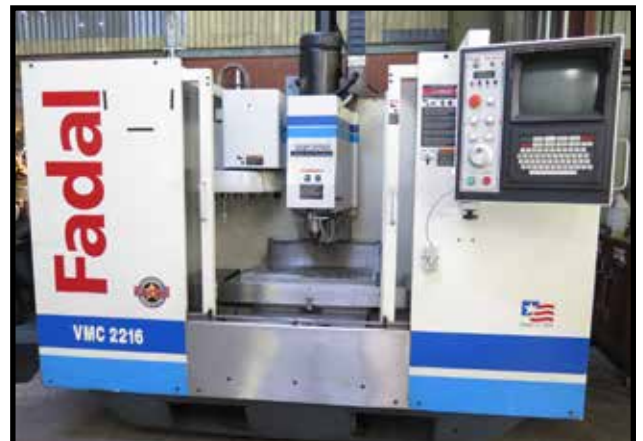
1993 Fadal VMC2216HT CNC Vertical Machining Center s/n 9303144 w/ Fadal CNC88HS Controls, 21-Station ATC,