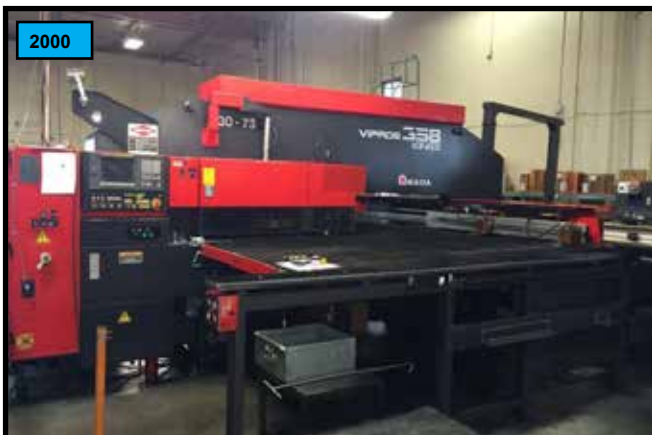
2000 Amada Vipros KING-II 33-Ton 58-Station CNC Turret Punch Press s/n 3540403 w/ Fanuc 18-PC Controls,(4) Auto Indexing Stations,50" x 72" Travels, 50" x 157" Max Sheet Size.