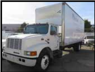
1999 International 4700 DT466E 24' Box Truck Lisc# 5V72188 w/ Diesel Engine, International -