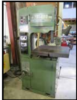
Jet mdl. VBS400 16" Vertical Band Saw s/n 41600 w/ Blade Welder