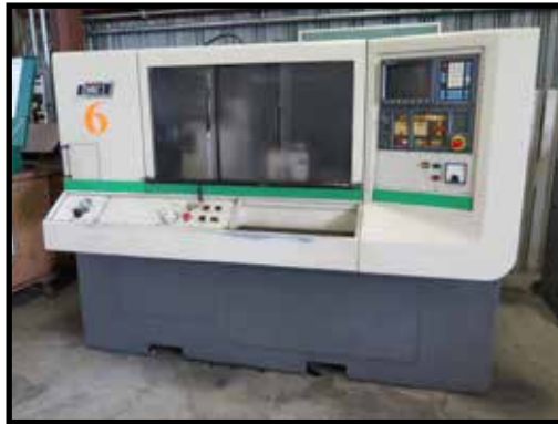
Hardinge CHNC-I CNC Chucker s/n CN-4252-T w/ Fanuc 0T Controls, 8-Station Turret, Cutoff Attachment, 16C Spindle, Coolant.