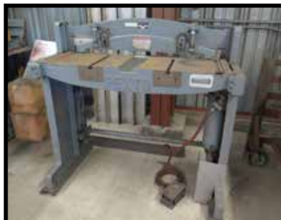
Pexto mdl. 137-K 10GA x 36" Pneumatic Shear s/n 5/63