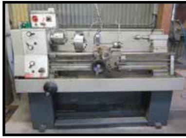
Clausing Colchester mdl. 600 13" x 42" Geared Head Lathe s/n 23/0003/00270DD w/ 60-2500 RPM, Inch Threading, Tailstock, 10" 4-Jaw and 6" 3-Jaw Chucks