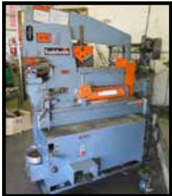
Scotchman mdl. 4014-C 40-Ton Iron Worker s/n 3974M1089