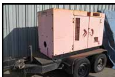
Multiquip mdl. DCA40SSAI 40kW Towable Diesel Generator