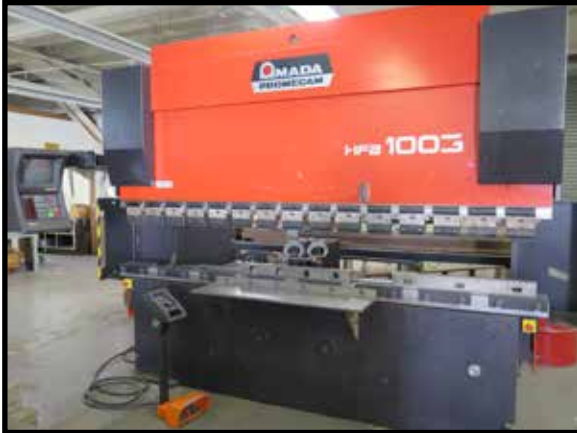
1997 Amada Promecam HFB1003 1000kN x 122" CNC Press Brake s/n HFBO100-30-R970707 w/ Amada Operateur Controls,