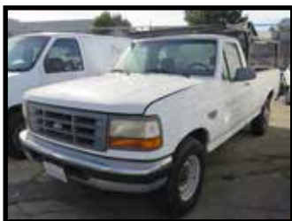
1994 Ford F250XL Power Stroke Diesel Pickup Truck Lisc# 5X87806