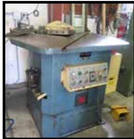
Amada mdl. CS-220 10-Ton 8 5/8" x 8 5/8" Power Notcher s/n 544694