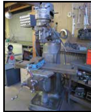
Bridgeport Vertical Mill s/n 72045 w/ 1Hp Motor, 80-2720 RPM, Chrome Ways, 9" x 42" Table