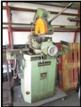
Scotchman / Bewo mdl. CPO350 HT-PK 12" Miter Cold Saw s/n 172608-91