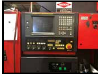
2000 Amada Vipros KING-II 33-Ton 58-Station CNC Turret Punch Press s/n 3540403 w/ Fanuc 18-PC Controls, (4) Auto Indexing -Stations, 50" x 72" Travels, 50" x 157" Max Sheet Size.