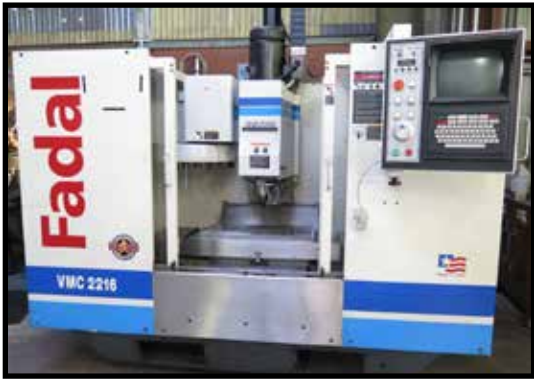
1993 Fadal VMC2216HT CNC Vertical Machining Center s/n 9303144 w/ Fadal CNC88HS Controls, 21-Station ATC, CAT-40 Spindle, 4 Meg Memory Expansion, Rigid Tapping,