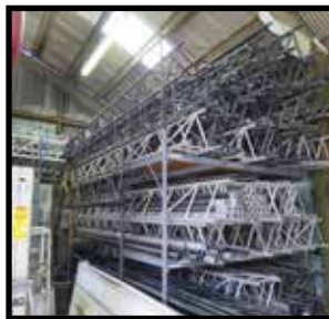
16" and 12" Triangular Aluminum Stage Truss