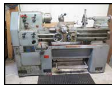
Chori mdl. TSL-800 12" x 35" Lathe w/ 70-1500 RPM, Inch/mm Threading, Tailstock, Steady Rest, 8" 3-Jaw Chuck