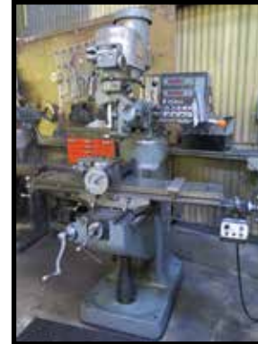
Bridgeport Series 1 – 2Hp Vertical Mill s/n 240002 w/ Acu-Rite III DRO, 60-4200 Dial RPM, Chrome Ways, Power Feed