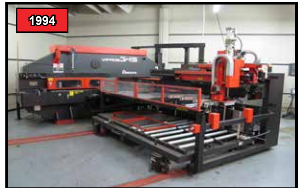
1994 AMADA VIPROS 345, 33 TON CNC TURRET PUNCH, W/ FANUC O4PC CONTROL, 58 STATION, 2 AUTO INDEX, AND AMADA MP1212NF LOAD SYSTEM, S/N AVP45027.