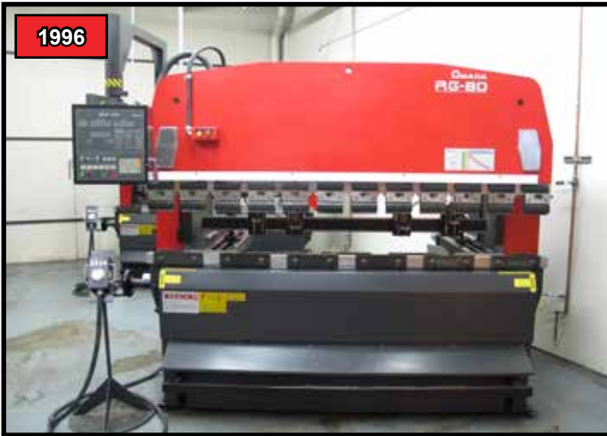
1996 AMADA RG-80, 8FT X 88 TON CNC PRESS BRAKE, WITH NC9EXII CONTROL, 3 AXIS BACK GAGE, S/N 811128.