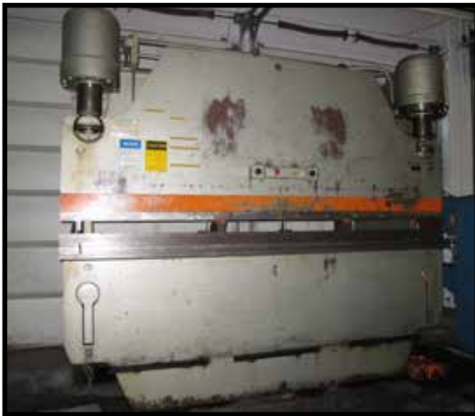
PACIFIC J225-12, 12FT X 225 TON HYD PRESS BRAKE, WITH PALM BUTTON CONTROLS.