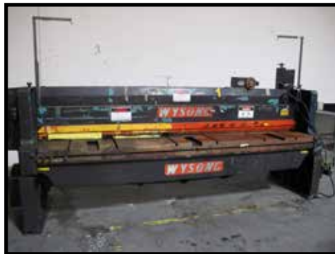
WYSONG 1010, 10FT X 10 GA MECHANICAL POWER SHEAR, WITH MANUAL BACKGAGE.