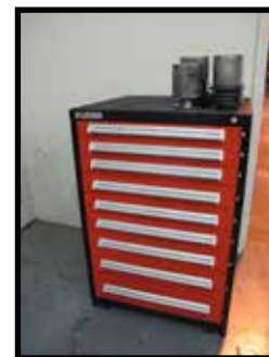
AMADA THICK TURRET TOOLING & CABINET