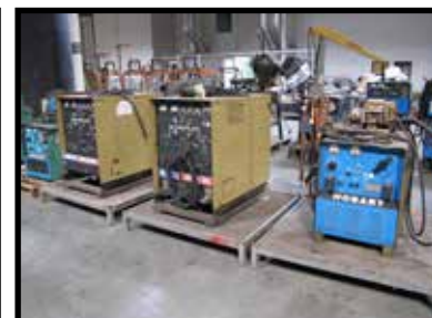
PARTIAL VIEW OF HOBART TIG WELDERS