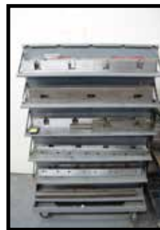
AMADA FORMING DIES