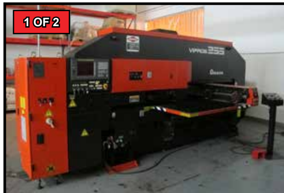
1 OF 2 2000 AMADA VIPROS 255, 22 TON CNC TURRET PUNCH, WITH FANUC 18-P CONTROL, BRUSH TABLE, 3 AUTO INDEX, THICK TURRET, 31 STATIONS