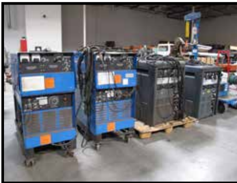
2) MILLER TIG-RIG WELDERS.