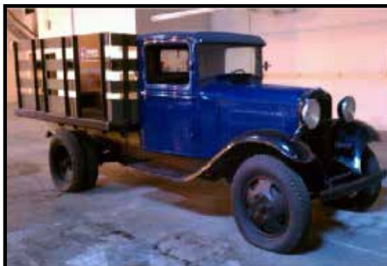
ANTIQUE FORD DELIVERY TRUCK