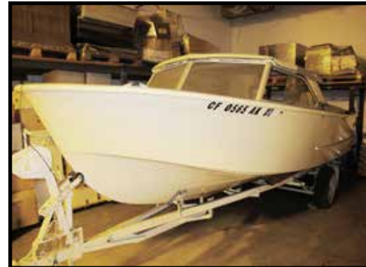
GLASSPAR SEAFAIR PHAETON FISHING BOAT W/ JOHNSON 70 MOTOR, TRAILER