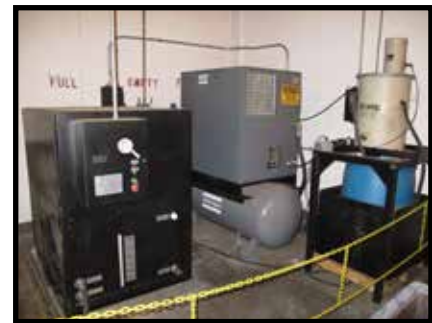
ATLAS COPCO GA22, 30 HP ROTARY AIR COMPRESSOR WITH DRYER AND OIL SEPARATOR.