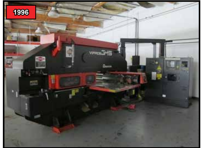
1996 1996 AMADA VIPROS 345, 33 TON CNC TURRET PUNCH, WITH FANUC O4PC CONTROL, 58 STATION, 2 AUTO INDEX, THICK TURRET, S/N AVP45040.