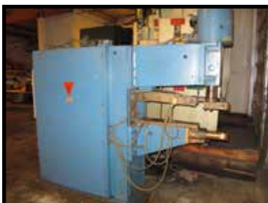
H & H 100 KVA SPOT WELDER MODEL 4.