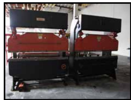
2) DIACRO 14-72, 6FT X 14GA HYDRA MECHANICAL PRESS BRAKES.