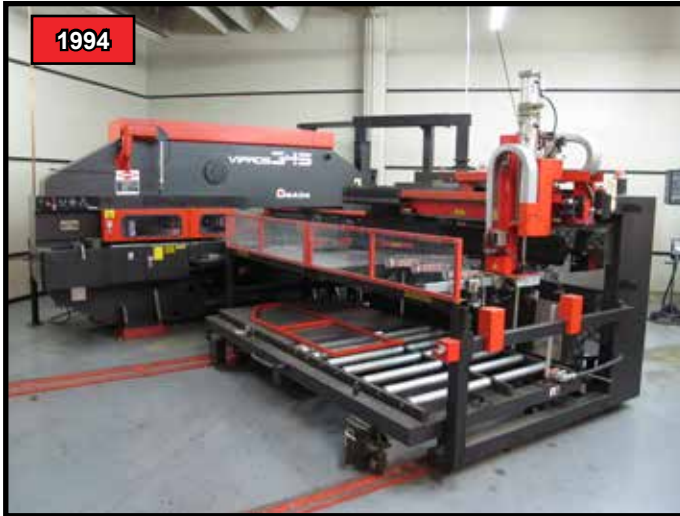
1994 1994 AMADA VIPROS 345, 33 TON CNC TURRET PUNCH, WITH FANUC O4PC CONTROL, 58 STATION, 2 AUTO INDEX, AND AMADA MP1212NF LOAD SYSTEM, S/N AVP45027.