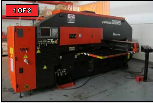
1 OF 2 (1 OF 2) 2000 AMADA VIPROS 255, 22 TON CNC TURRET PUNCH, WITH FANUC 18-P CONTROL, BRUSH TABLE, 3 AUTO INDEX, THICK TURRET, 31 STATIONS