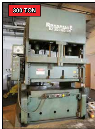
ROUSSELLE B2-300-60-30, 300 TON GAP FRAME PUNCH PRESS, 35 SPM, 4" STROKE, 18" SHUT HEIGHT, 60" X 30" TABLE, S/N 23102.