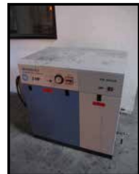
POWEREX 3HP ROTARY AIR COMPRESSOR W/ AIR DRYER