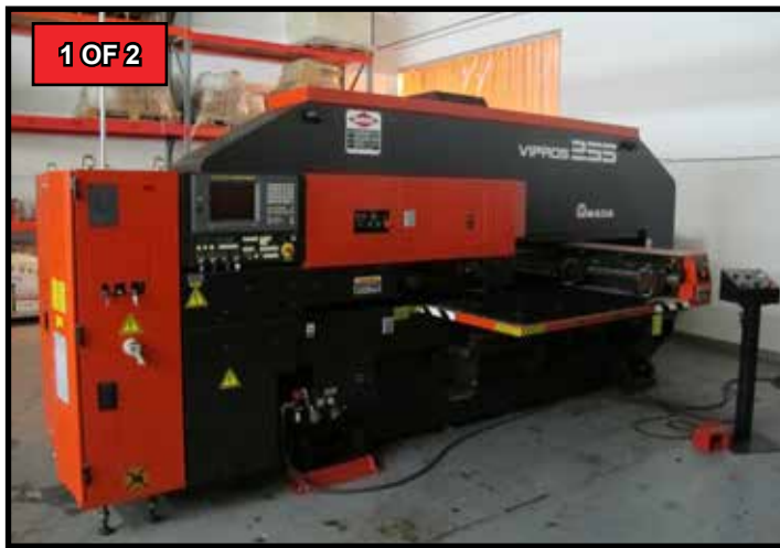
AMADA FORMING DEPARTMENT