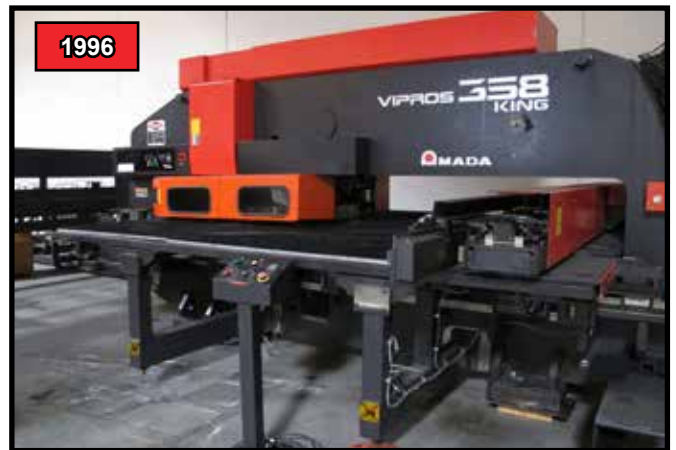
1996 1996 AMADA VIPROS 358 KING, 33 TON CNC TURRET PUNCH, WITH AMADA O4PC CONTROL, 58 STATION, BRUSH TABLE, 2 AUTO INDEX, S/N 35820284.