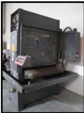
ARMCO 37W175, 37" WET WIDE BELT GRAINER.