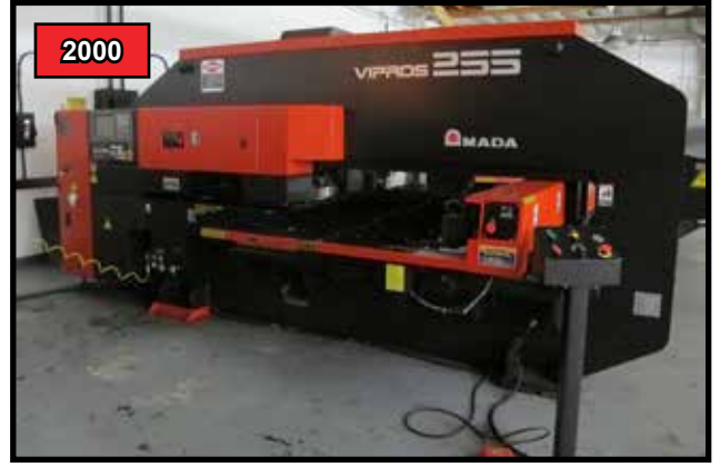
2000 2000 AMADA VIPROS 255, 22 TON CNC TURRET PUNCH, WITH FANUC 18-P CONTROL, BRUSH TABLE, 3 AUTO INDEX, THICK TURRET, 31 STATION, S/N AVP55285.