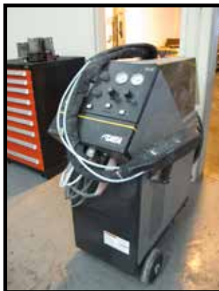
TAFAMODEL 9000 ARC SPRAY SYSTEM WITH GUN.