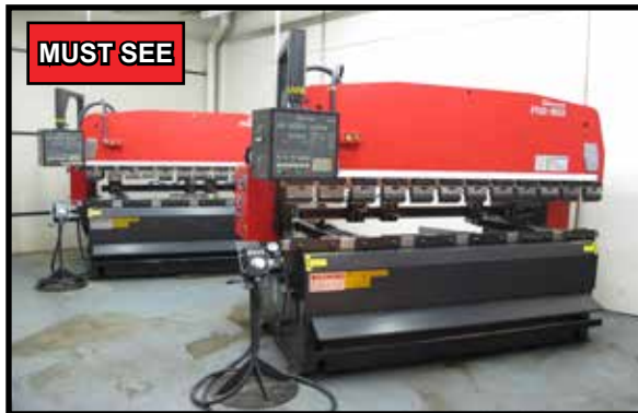
AMADA FORMING DEPARTMENT