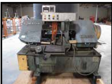
AMADA H250 HORIZONTAL BAND SAW.