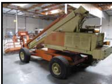
THOMAS 2066 BOOM LIFT.