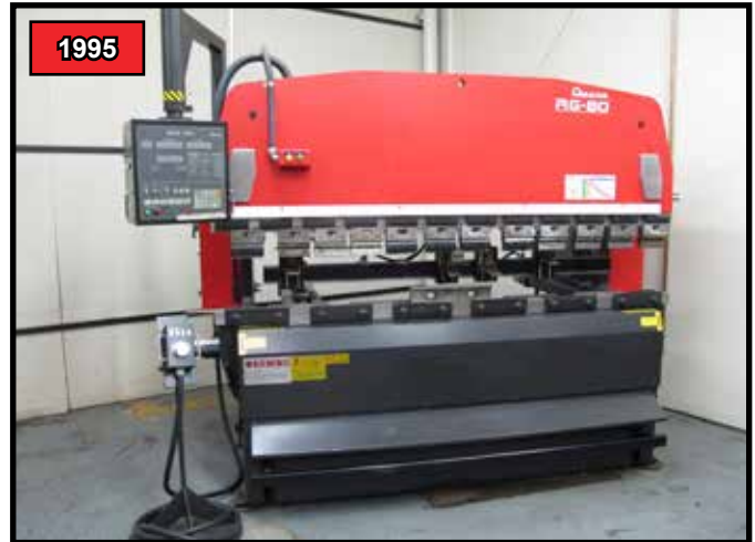
1995 AMADA RG-80, 8FT X 88 TON CNC PRESS BRAKE, WITH NC9EXII CONTROL, 3 AXIS BACK GAGE, S/N 810892.