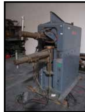
ACME 75 KVA SPOT WELDER MODEL 4C-36-75.