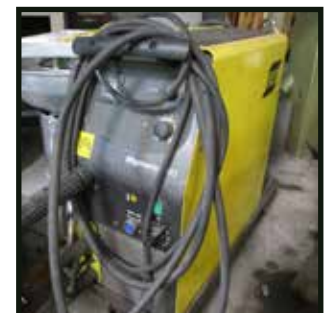
ESAB MIGMASTER 53 WELDER