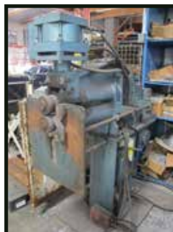
MAPLEWOOD 520 H.D. ROTARY BEADER