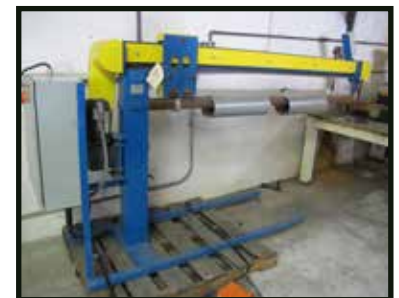
AMERITECH SM 6012