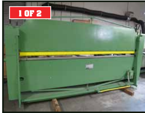
ROTO-DIE MODEL 10, 10FT HYD BRAKE