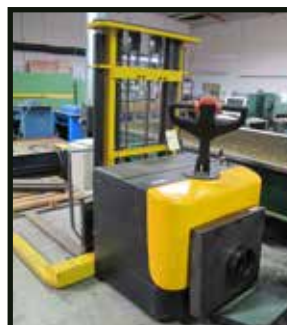
ELECTRIC PALLET JACK LIFT 2500 LB CAP