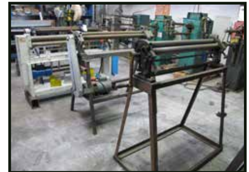
LARGE SELECTION OF PLATE ROLLS