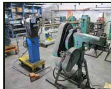
NIAGARA 172 AND PEXTO BEADERS