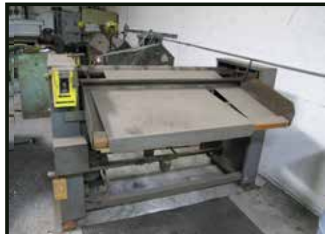
48" MECHANICAL BEADER