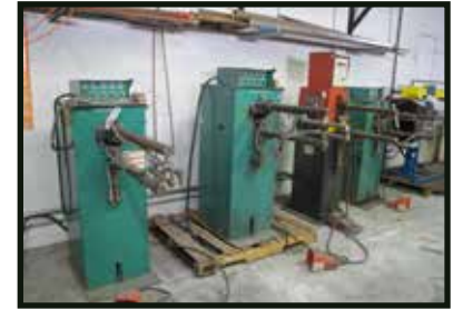
(5) ACME & WESTERN ARCTRONICS SPOT WELDERS 10 KVA TO 30 KVA