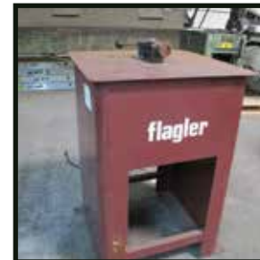
FLAGLER 20 GA-PF EDGE MASTER