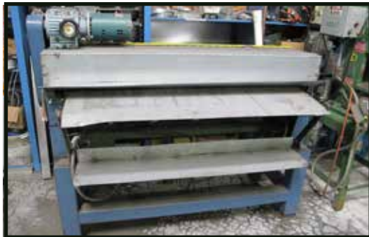
60" MECHANICAL BEADER