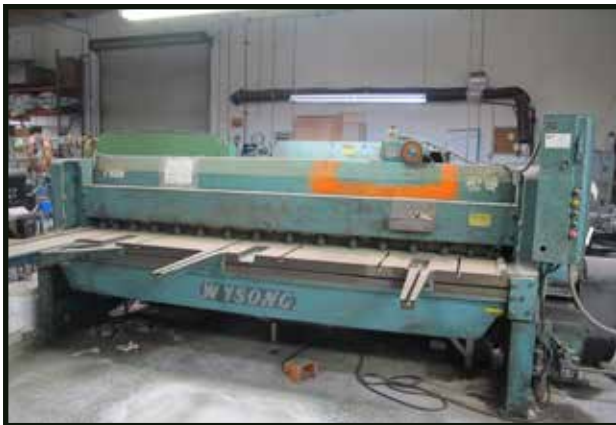
WYSONG 1010, 10FT x 3/16” POWER SHEAR W/F.O.P.B.G. S/N: P32-1643