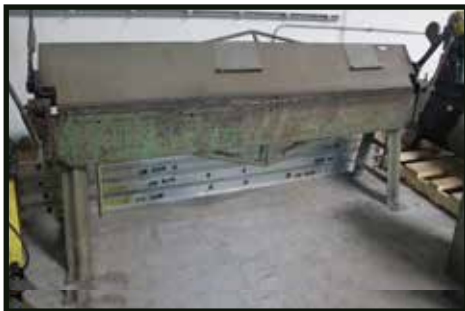
CHICAGO 8FT HAND BRAKE