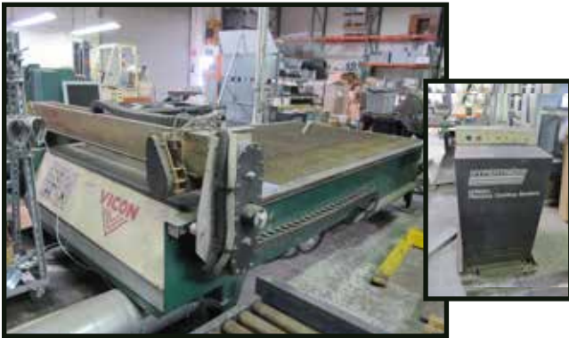
VICON 5FT x 10FT CNC PLASMA TABLE