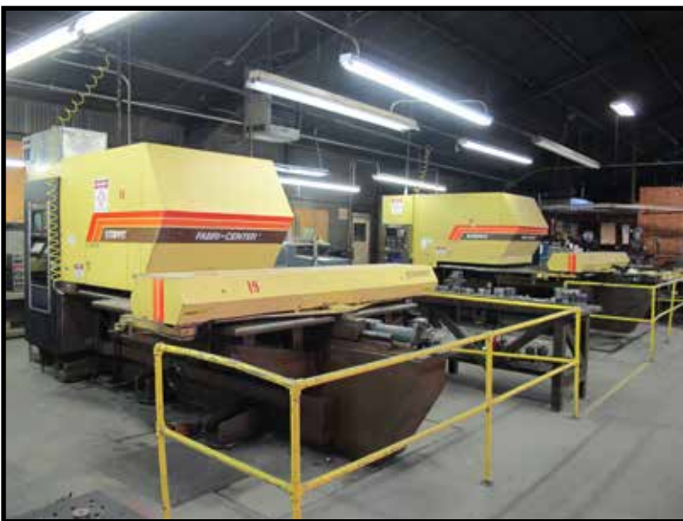
STRIPPIT FC 1000 III, 33 TON CNC TURRET PUNCH PRESSES