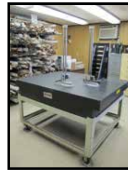
INSPECTION TOOLS & MOJAVE SURFACE PLATE