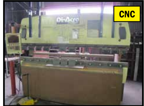
DI-ACRO 8 FT x 90 TON HYD PRESS BRAKE, MODEL IT2-80-25