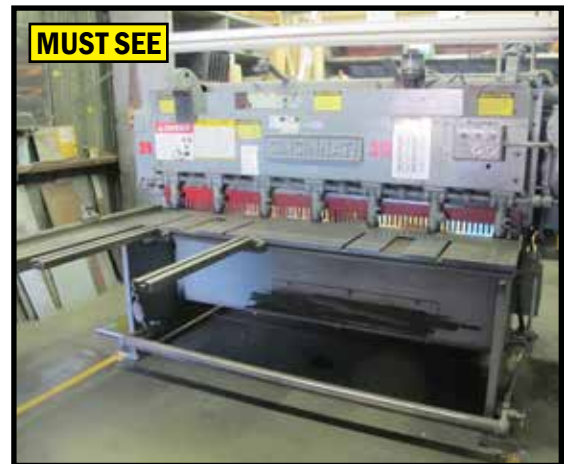
CINCINNATI 1006, 6 FT x 10 GA POWER SHEAR W/ F.O.P.G.