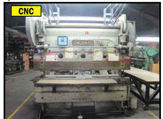
CINCINNATI 8FT x 80 TON MECHANICAL PRESS BRAKE W/ AUTO GAGE CNC BACK GAGE