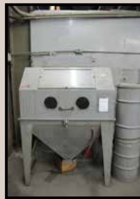
SAND BLAST CABINET