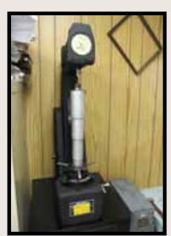
WILSON ROCKWELL HARDNESS TESTER