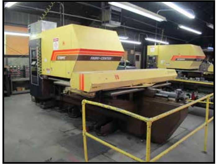
STRIPPIT FC 1000 III, 33 TON CNC TURRET PUNCH W/HOUDAILLE CONTROL, S/N: 187111284