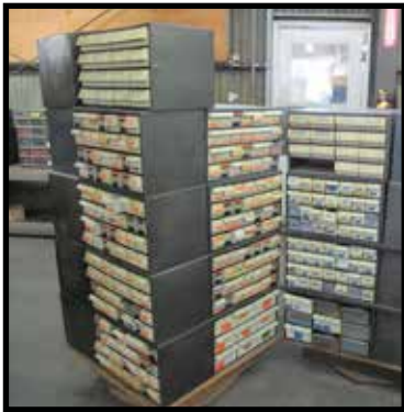
PARTIAL VIEW OF STRIPPIT THINTURRET TOOLING