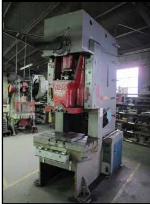
AIDA PP-XGC-100, 110 TON GAP FRAME PUNCH PRESS, W/50 SPM, ALLEN BRADLEY CONTROLS