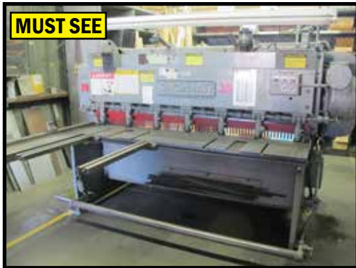
CINCINNATI 1006, 6 FT x 10 GA POWER SHEAR W/ F.O.P.G.