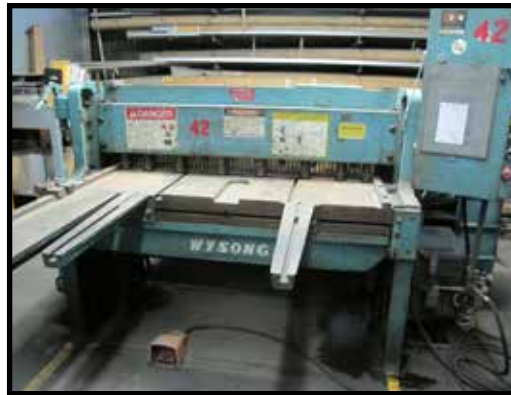
WYUSONG 252, 53" x 12 GA POWER SHEAR S/N: P13-1442