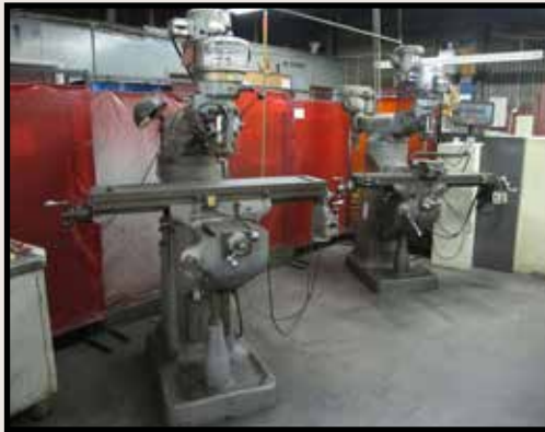
BRIDGEPORT VERTICAL MILLS W/ DRO & P.F.