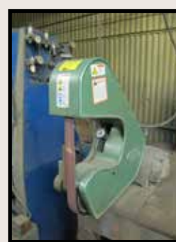
BURR KING 760 SANDER