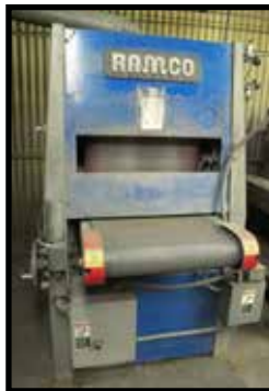
RAMCO MODEL 25, 25" WIDE BELT GRAINER