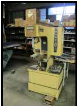
HAEGER 6 TON HYD INSERTION PRESS W/BOWL FEED