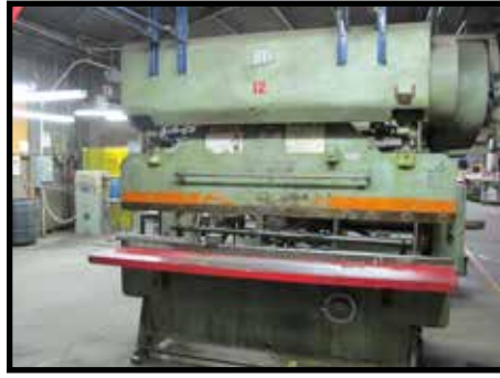
HTC 8FT x 55 TON MECHANICAL PRESS BRAKE MODEL 8 FM55