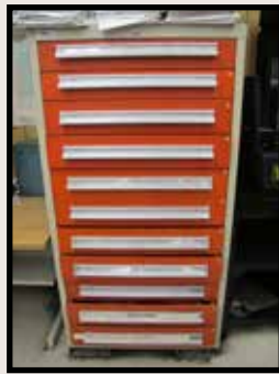
LYON TOOL CABINET