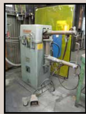
STANDARD 50KVA SPOT WELDER