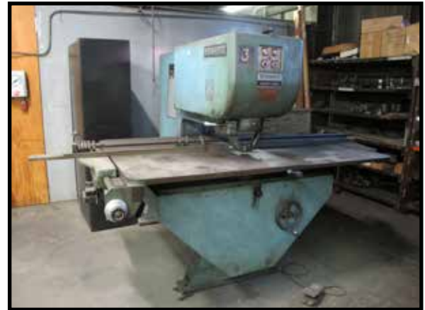
STRIPPIT SUPER 30 SINGLE END PUNCH