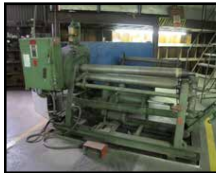
LOWN MODEL B400, 4 FT INITIAL PINCH PLATE ROLL W/4" ROLLS.