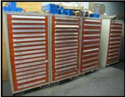
LYON TOOL CABINETS W/ 100's OF CUTTING TOOLS