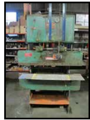
CHICAGO 4FT x 15 TON MECHANICAL PRESS BRAKE.