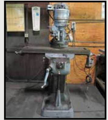
BRIDGEPORT VERTICAL MILL W/P.F. TABLE