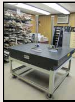
INSPECTION TOOLS & MOJAVE SURFACE PLATE