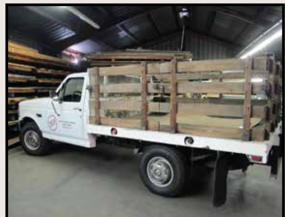
1997 FORD F250-HD, 8FT STAKE BED TRUCK

LOWN MODEL B400, 4FT X 4" ROLL INITIAL PINCH PLATE ROLLS.