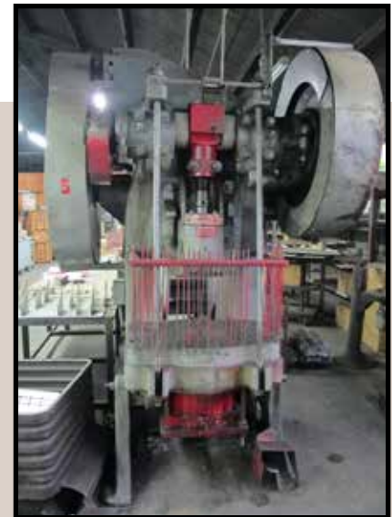
FERRACUTE 75 TON OBI PUNCH PRESS