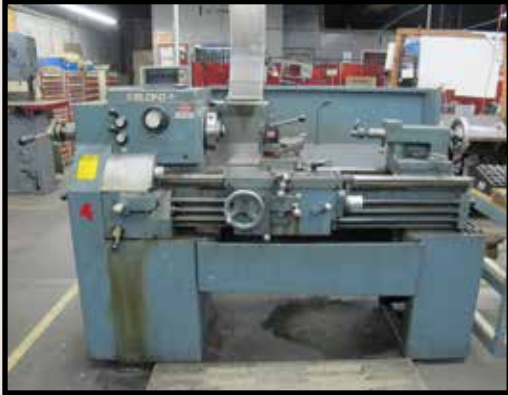
LE BLOND REGAL 17" ENGINE LATHE W/ SERVO SHIFT