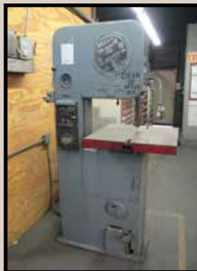
DO-ALL VERTICAL BAND SAW W/WELDER