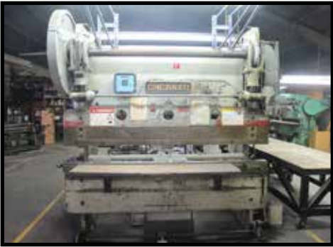
CINCINNATI 8FT x 80 TON MECHANICAL PRESS BRAKE W/ AUTOGAGE CNC BACK GAGE