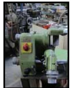
TOOL LIP GRINDER