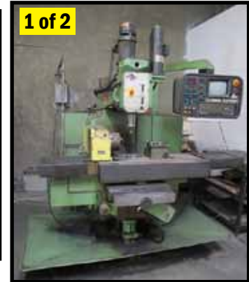
1 of 2