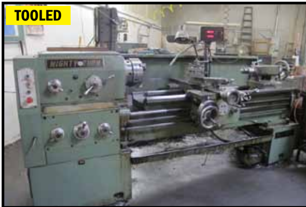
TOOLED MIGHTY-TURN ML-1860GL, 18 X 60 GAP ENGINE LATHE W/DRO