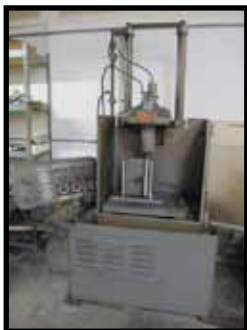
SUPERIOR HONE MODEL VA VERTICAL HONE S/N: 2800-B116