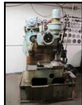
FELLOWS HIGH SPEED GEAR SHAPER

RF MODEL RF-712N HORIZONTAL BAND SAW W.F. WELLS HORIZONTAL BAND SAW DECKEL GK21, 3 DIMENSIONAL PANTOGRAPH, S/N7467 GORTON TOOL GRINDER DECKEL NO. SO/66-8659 DECKEL NO. SO/77-18273 TOOL LIP GRINDER FAMCO NO.4 ARBOR PRESS TOOLING, CUTTING TOOLS, CARBIDE AND DIAMOND CUTTING TOOLS END MILLS, VISES, CHUCK, INDEXERS, DIVIDING HEADS, 4th AXIS ROTARY TABLES