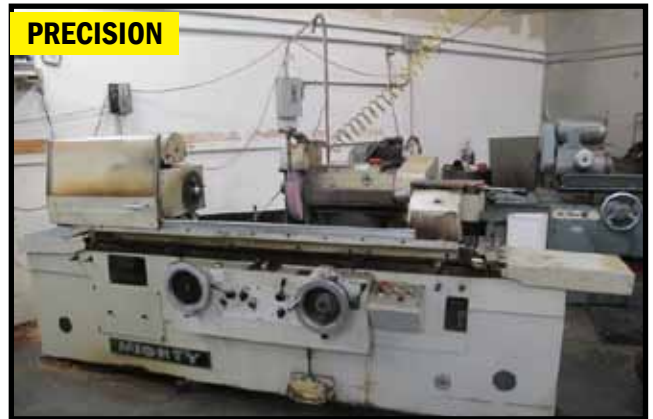
PRECISION MIGHTY 13 X 40 PRECISION O.D. GRINDER S/N: 89047