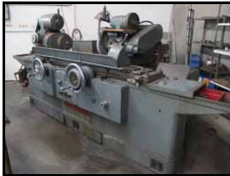
CINCINNATI 14 X 36 OD GRINDER