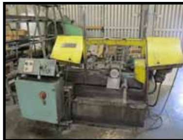
W.F. WELLS HORIZONTAL BAND SAW