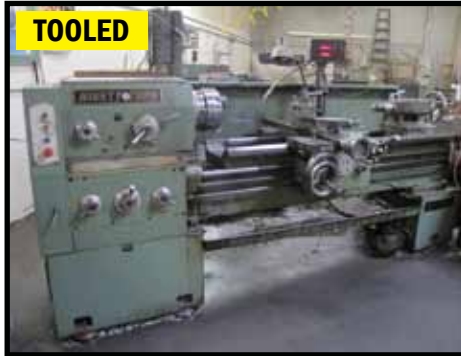
TOOLED MIGHTY-TURN ML-1860GL, 18 X 60 GAP ENGINE LATHE W/DRO