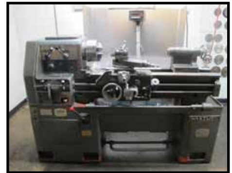
TAKISAWA MAX 800 ENGINE LATHE