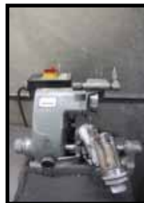
DEKEL 50/77 -18273 TOOL LIP G GRINDER