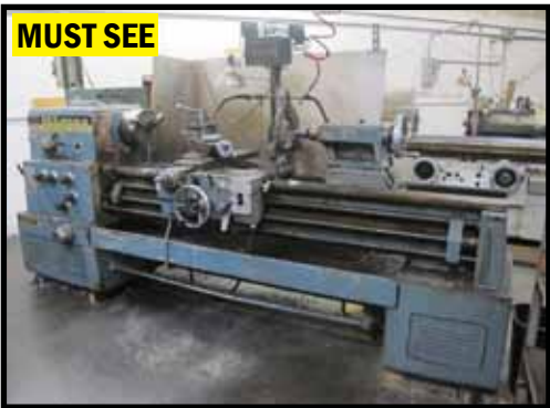
MUST SEE H.E.S. 20" ENGINE LATHE W/DRO