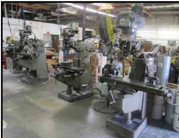
VERTICAL MILLING DEPARTMENT