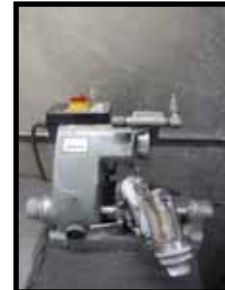
DEKEL 50/66-8659 TOOL LIP GRINDER