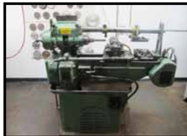
BARBER-COLMAN NO.3 GEAR HOBBER