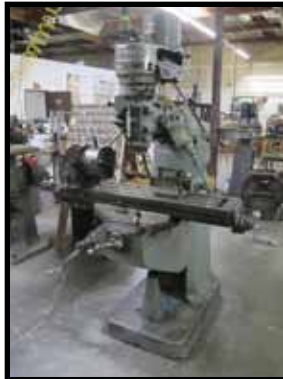
BRIDGEPORT VERTICAL MILL W/J-HEAD