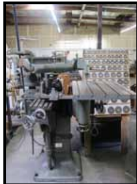
DECKEL GK-21 3 DIMENSIONAL PANTOGRAPH