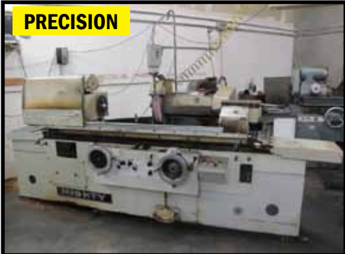
PRECISION MIGHTY 13 X 40 PRECISION O.D. GRINDER S/N: 89047