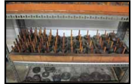
VARIOUS CHANGE GEARS FOR GEAR CUTTING