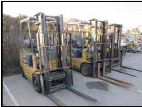
PARTIAL VIEW OF CAT 4000 LB FORKLIFTS