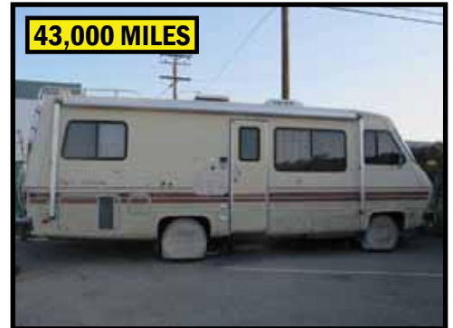
1985 FLEETWOOD PACE-ARROW MOTOR HOME, MODEL H, 43,000 MILES