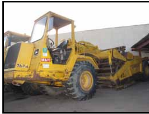
JOHN DEERE 762A PADDLE SCRAPER, 6250 HOURS