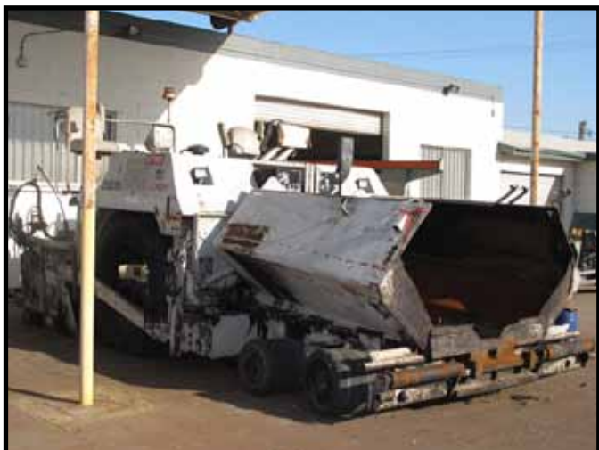
2000 CEDARAPIDS CR551 RUBBER TIRE PAVER, 5300 HOURS