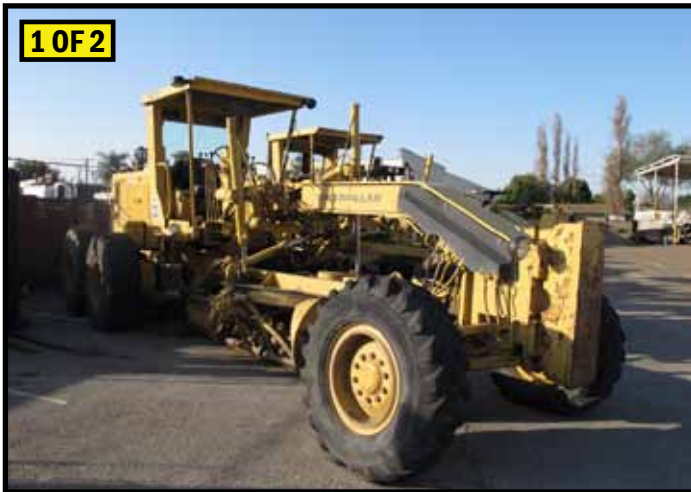
1989 CAT 140G MOTOR GRADER