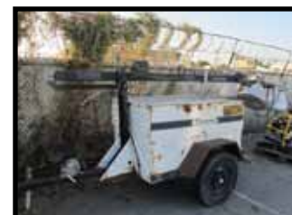
COLEMAN LIGHT TOWER