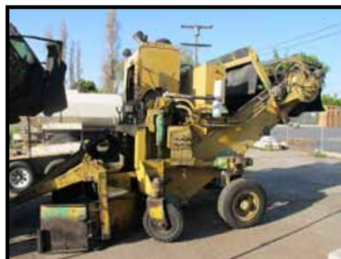
1990 BARBER GREEN 610H WINDROW ELEVATOR PICKUP MACHINE, 6900 HOURS