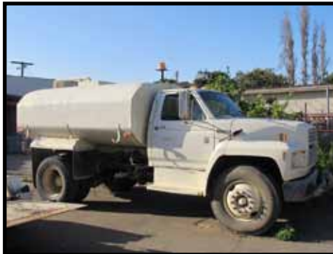
1990 FORD F800, 2000 GALLON WATER TRUCK, 124,000 MILES