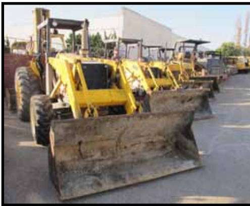
VIEW OF SKIP LOADERS