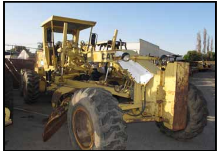
1990 CAT 140G MOTOR GRADER