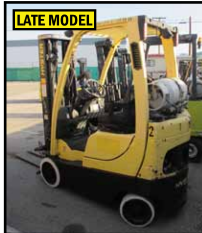
HYSTER S30FT, 3000 LB LPG FORKLIFT