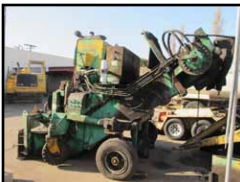
1990 BARBER GREEN 610H WINDROW ELEVATOR PICKUP MACHINE, 1100 HOURS