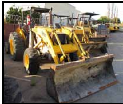
1996 MF650 SKIP LOADER W/ GANNON BOX, 7700 HOURS