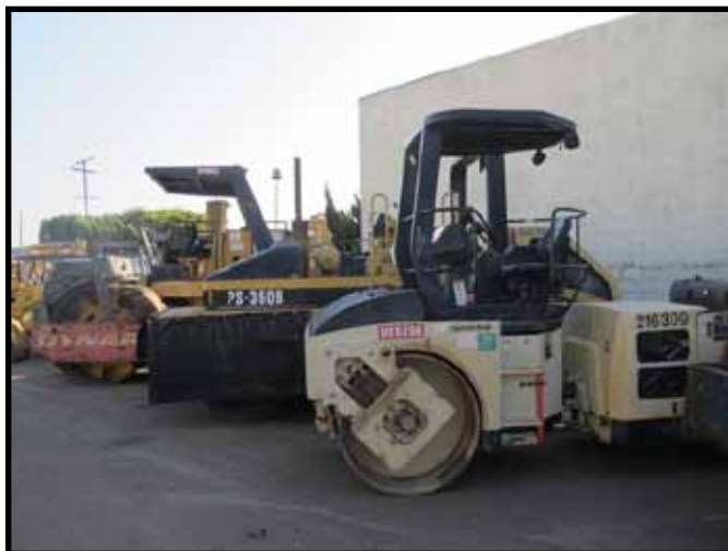
PARTIAL VIEW OF ASPHALT ROLLERS