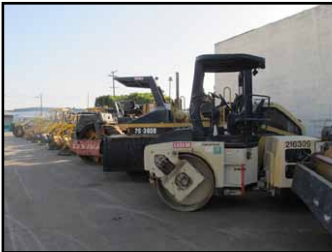
VIEW OF CONSTRUCTION EQUIPMENT FLEET

ASSETS NO LONGER NEED FOR, A MAJOR INDUSTRIAL CONTRACTING CO.