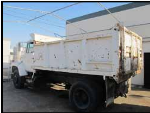
1981 FORD LN800 6 WHEEL DUMP TRUCK, GAS