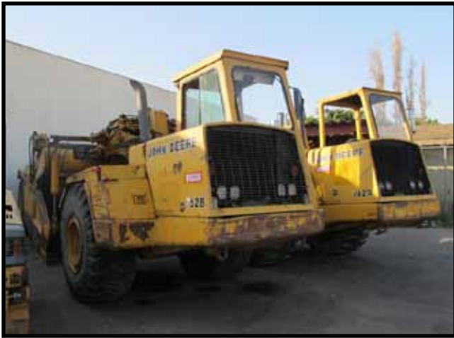
(2) JOHN DEERE 762A & 762B PADDLE SCRAPERS