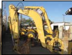
2000 CAT 446B BACKHOE, TURBO, 7900 HOURS