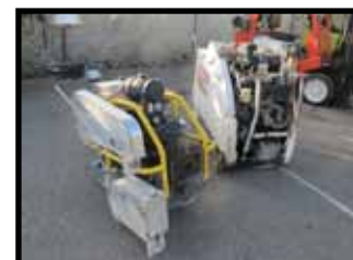
MECO 37HP & SOFF CUT X-4000 CONCRETE SAWS