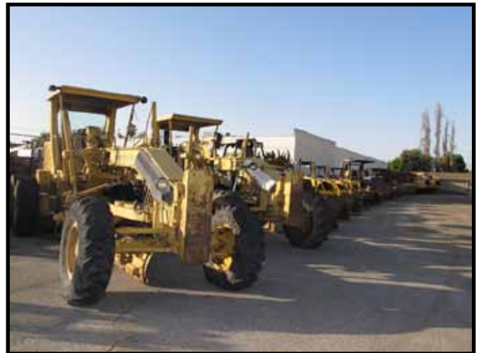
VIEW OF CONSTRUCTION EQUIPMENT FLEET