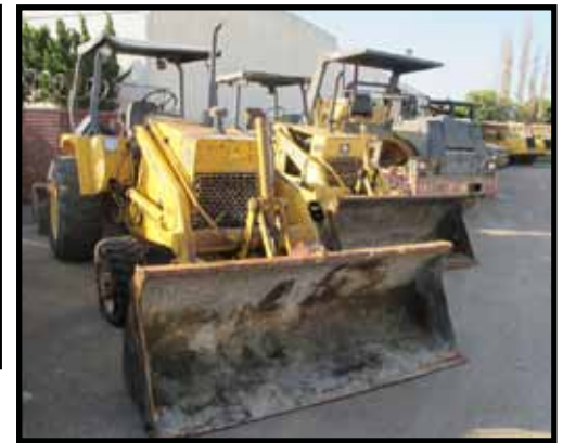
(2) JOHN DEERE, 1994 & 1989 2100 SKIP LOADERS W/ GANNON BOX