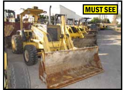
2001 JOHN DEERE 210LE SKIP LOADER W/ GANNON BOX, 4 x 4, 9115 HOURS