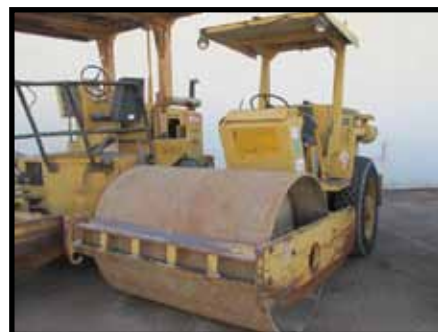
DYNAPAC CA15 SINGLE DRUM VIB ROLLER, 5-8 TON