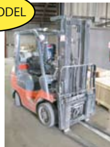
(1 OF 2) TOYOTA 5000lb LPG FORKLIFT