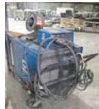
MILLER CP - 302 MIG WELDER