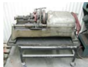
RIDGIT 535 PIPE THREADER