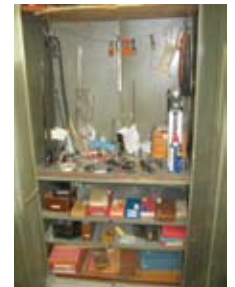
PARTIAL VIEW OF INSPECTION TOOLS