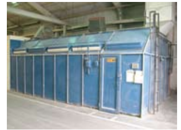
WALK - IN SPRAY BOOTH