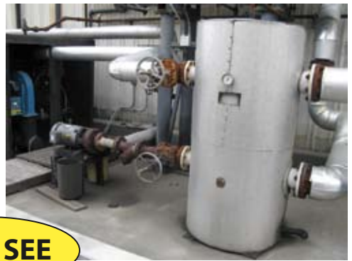
2005 PARKER STEAM BOILER, 3226 lb/HR, S/N: 56294