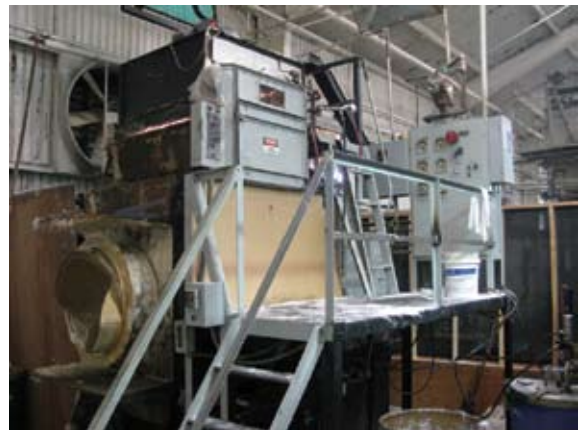
I. G. BRENNER 30" PRE - FORMER, W/ UPGRADED CONTROLS, S/N: 807