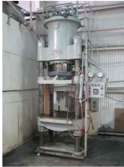
HYSCO 785 TON HYD PRESS, 32" X 40" PLATTEN