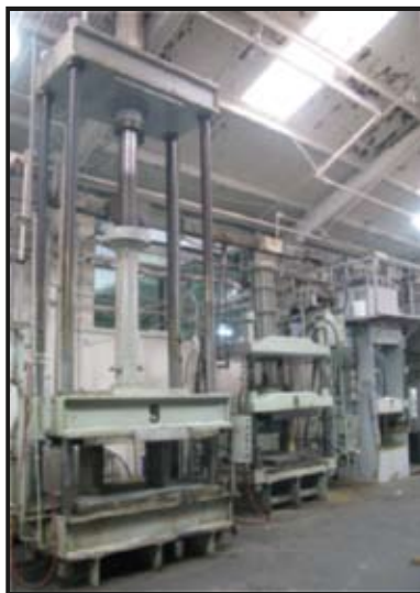
VIEW OF HYDRAULIC PRESSES