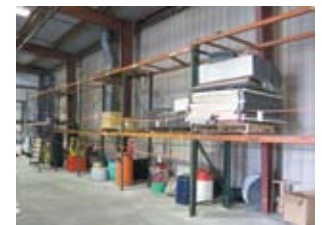
PARTIAL VIEW OF PALLET RACKS