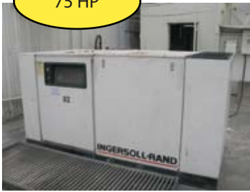
IR SSR - EP75, 75 HP ROTARY SCREW COMPRESSOR