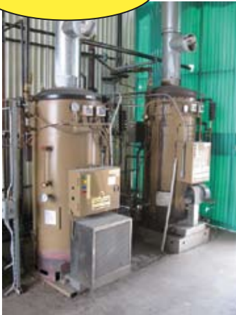
(2) 2002 & 2009 THERMO - STEAM BOILERS, 630,000 BTU/HR