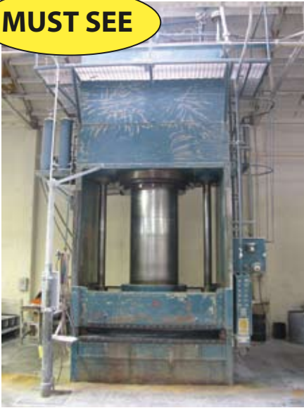
HYSCO 1300 TON HYD PRESS, 60" Stroke, 90" X 60" PLATTEN