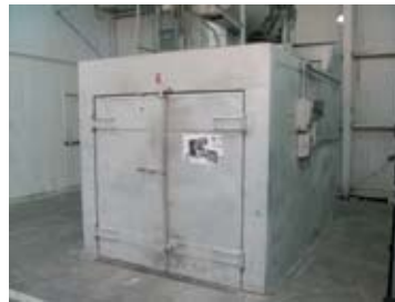
WALK - IN GAS OVEN, 6FT X 10FT X 68"