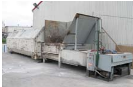
DEMPTER HYD TRASH COMPACTOR