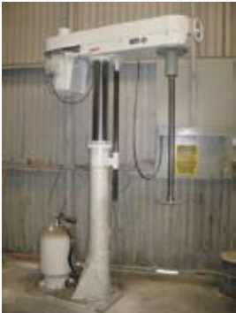
BESTWAY HYD INDUSTRIAL MIXER, 48" SHAFT