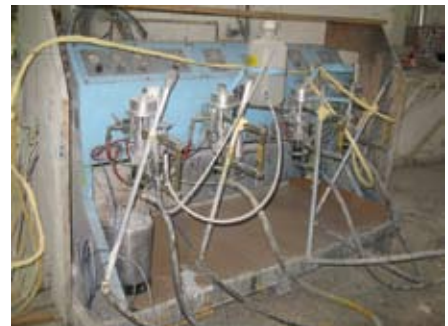
VENUS 4 SPRAY GUNS