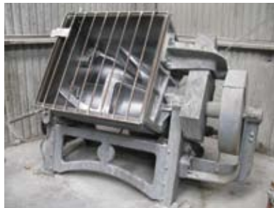
J. H. DAY 32" X 36" NO. 6 MIXER