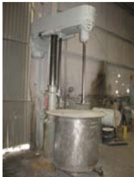
48" SHAFT, INDUSTRIAL MIXER