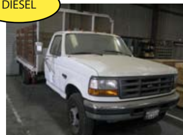
1995 FORD 14 FT STAKE BED TRUCK