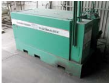
GARDNER DENVER 50 HP ROTARY SCREW AIR COMPRESSOR