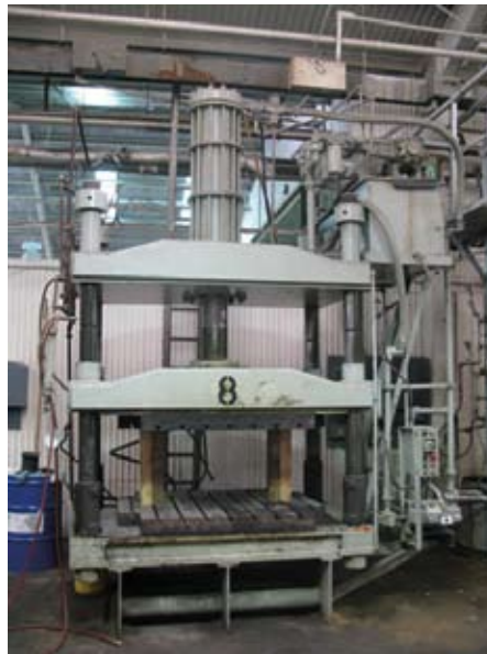
125 TON HYD PRESS, T-SLOTTED TABLE, 36" STROKE, 48" X 48" PLATTEN