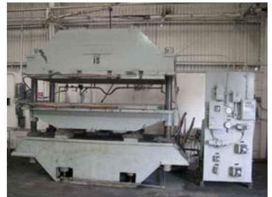
ERIE ENG , 170 TON, 60" X 102" HEAT PLATTEN PRESS