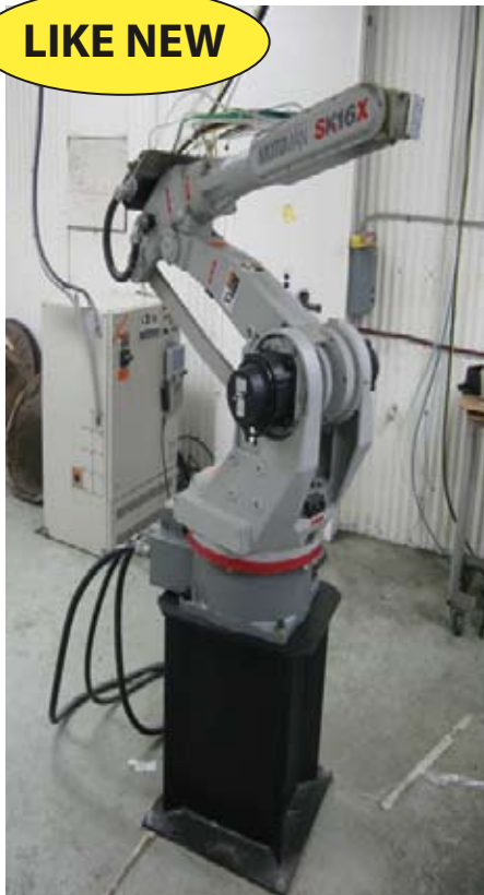
2000 MOTOMAN 5K16X ROBOT W/YASNAC CONTROL, TYPE ERCR - 5K16X - BB00