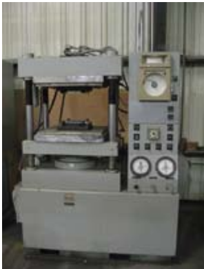
PHI 24" X 24" LAB PLATTEN PRESS