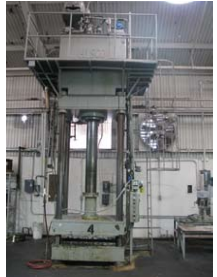
HYSCO , 200 TON 44" x40" HYD PRESS, 60" STROKE