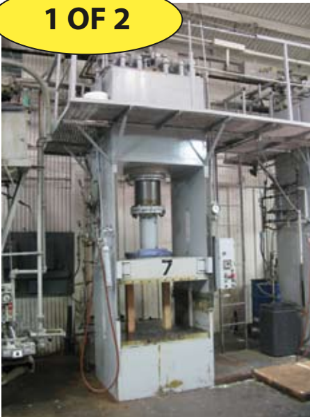
(10F2) 200 TON HYD PRESSES, 48" X 48" PLATTEN 50" STROKE