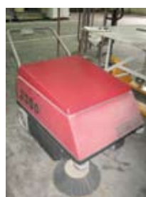
INDUSTRIAL ELECTRIC SWEEPER