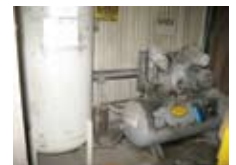
IR T - 30, 10, HP AIR COMPRESSOR W/ TANK