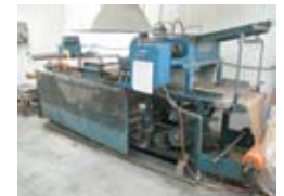
FINN & FRAM 30" RESIN - FIBERGLASS MAT MACHINE W/ WINDER, SIN: 1437