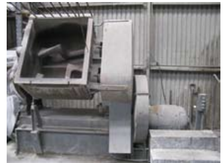
J. H. DAY 32" X 36" MIXER, 25 HP