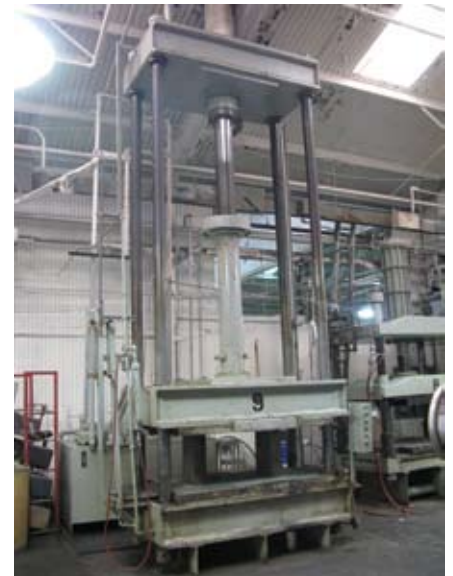
JONES & LAUGHLIN 1100 TON HEAT PLATTEN PRESS, 70" X 48" , 60" STROKE