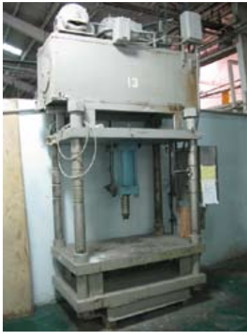
HYD PRESS 3FT X 4FT PLATTEN