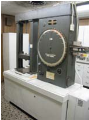
TINIUS - OLSEN TENSILE TESTING MACHINE