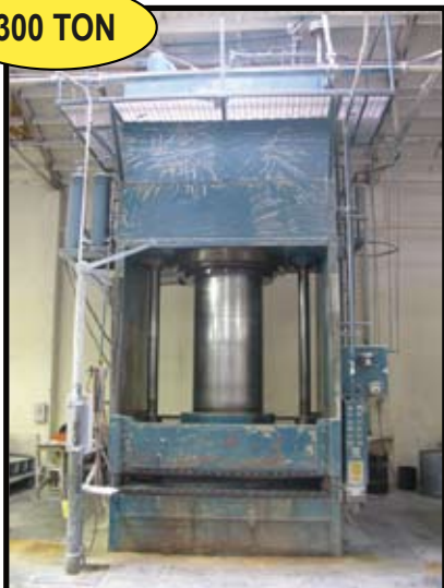
HYSKO 1300 TON HYD PRESS, 60" STROKE, 90" X 60" PLATTEN