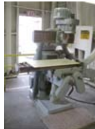
TREE KNEE MILL MODEL 2UVRC