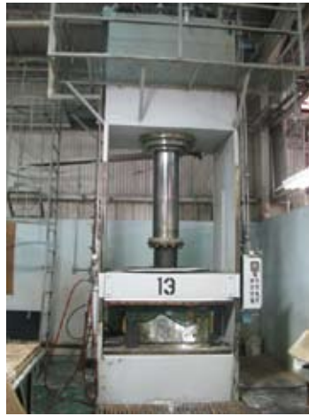
HYSCO , 350 TON , 60" X 44" PLATTEN, 36" Stroke