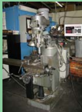
BRIDGEPORT CNC MILL W/EZ TRAK CONTROL