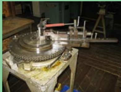
DI-ACRO NO.3 BAR BENDER