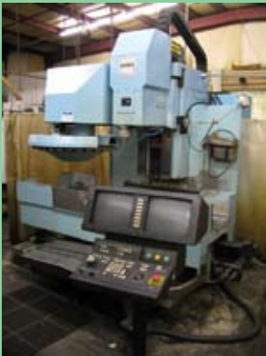
HURCO BNC-40 CNC VMC