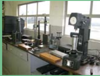
PARTIAL VIEW OF INSPECTION DEPT.