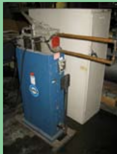
MILLER MPS-20, 20KVA SPOT WELDER