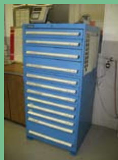
PARTIAL VIEW OF LISTA TOOL CABINETS