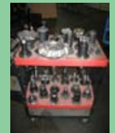
PARTIAL VIEW OF CNC TOOL HOLDERS