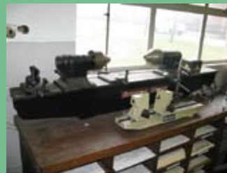
BROWN & SHARPE CENTERS