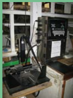
DOMINO A200 METAL MARKING MACHINE