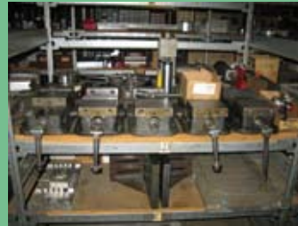
PARTIAL VIEW OF VISES AND TOOLING