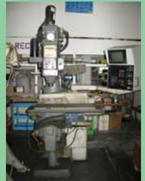
BRIDGEPORT CNC KNEE MILL