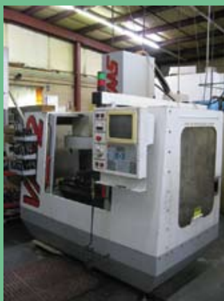
HAAS 1996 VF-2 CNC VMC SN#: 6953