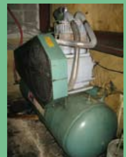
CHAMPION AIR COMPRESSOR, 10 HP.