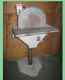
MAX 20" DISK SANDER