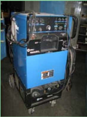
MILLER SYNCROWAVE 350 LX TIG WELDER