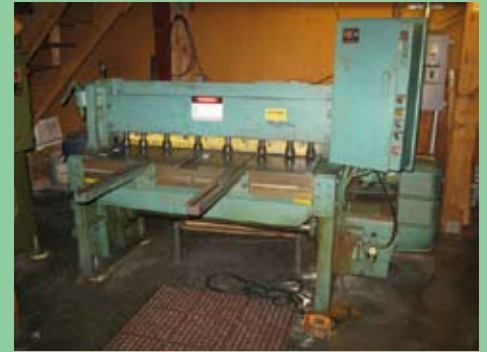
WYSONG 1252, 52" x 12 GA POWER SHEAR