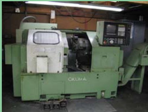
OKUMA LB 15 CNC LATHE W/BARFEED, S/N:9686