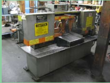
HEM H90A-BIF HORIZ BAND SAW W/FEED