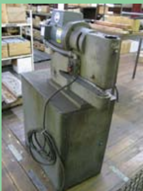
TRACE A PUNCH MODEL 4 NIBBLER