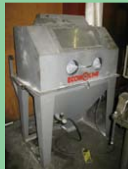
ECONOLINE SAND BLAST CABINET