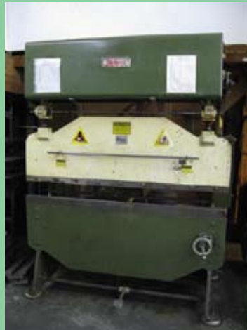
DI-ACRO 14-72 6FTx14 GA HYD BRAKE