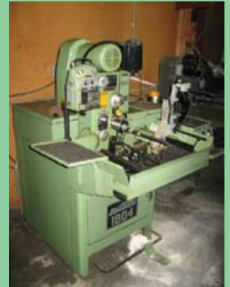
SUNNEN 1804 HONING MACHINE W/STROKER