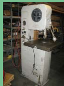
DO-ALL 16" VERTICAL BAND SAW