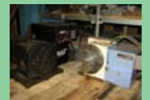
VIEW OF 4 TH AXIS HAAS/KITAGAWA ROTARY