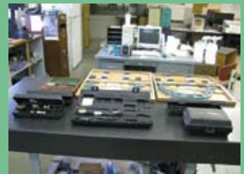
PARTIAL VIEW OF INSPECTIONS TOOLS