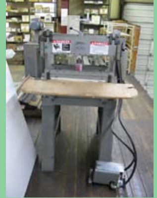
BANTHAM 12 TON x 18" BRAKE