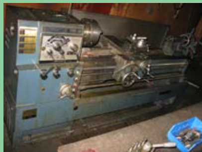
OSAMA SR. 17x60 GAP ENGINE LATHE