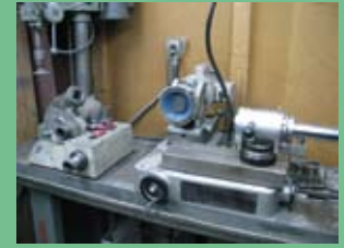
CUTTERMASTER END MILL SHARPENER