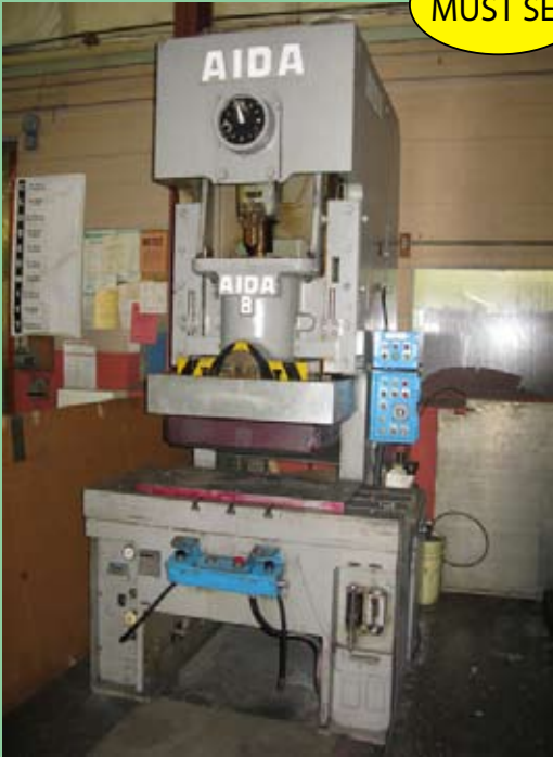
AIDA CI-8 (2), 88 TON GAP FRAME PUNCH PRESS