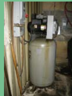
IR VERTICAL AIR COMPRESSOR, 7.5 HP.