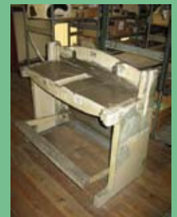
PEXTO 36" FOOT SHEAR