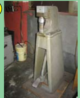
1 of 2) SHRINK / STRETCH MACHINE