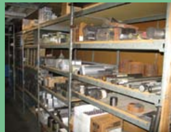
PARTIAL VIEW OF MATERIAL