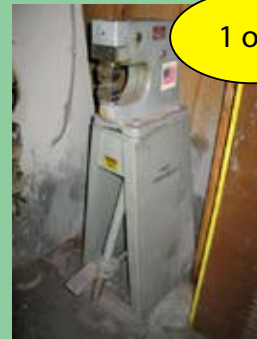
1 of 2) TOWNSEND 1447 SHRINK/STRETCH MACHINE