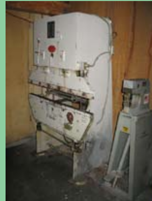
CHICAGO 4 FTx15 TON MECH PRESS BRAKE