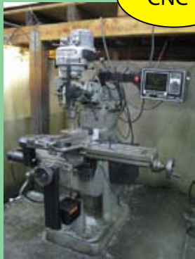
BRIDGEPORT CNC KNEE MILL W/ PROTO TRAK CONTROL