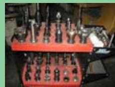
PARTIAL VIEW OF 40 TAPER TOOLING