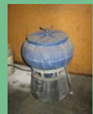
G&M VIBRATORY TUMBLER