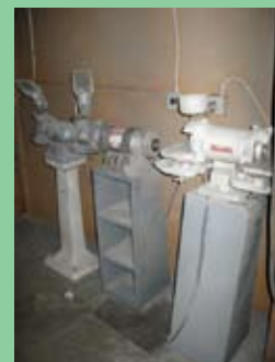
PARTIAL VIEW OF GRINDERS