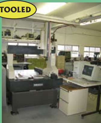
MITUTOYO B241 CMM