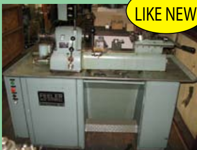
FEELER 2ND OP LATHE