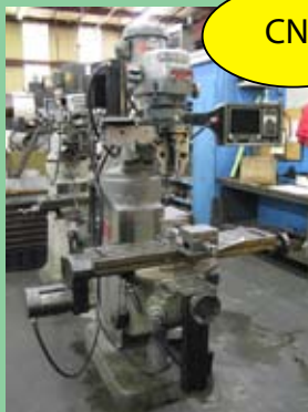
BRIDGEPORT CNC KNEE MILL W/PROTO TRAK CNC 3 AXIS CONTROL