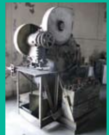
KLING MECHANICAL IRON WORKER