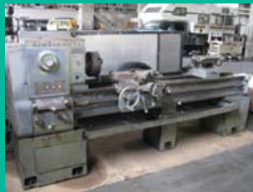
CINCINNATI 19" x 72" ENGINE LATHE