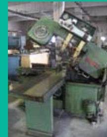
DO-ALL 16" HORIZ BAND SAW