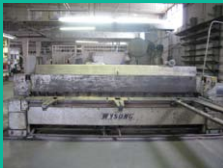
WYSONG 12FT x 1/4" POWER SHEAR