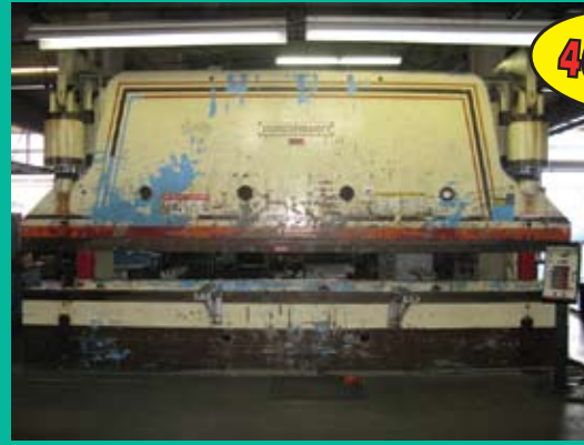
CINCINNATI 400FM, 20FT x 400 TON FORM MASTER HYD PRESS BRAKE, SIN:41178

VARIOUS PRESS BRAKE TOOLING, PUNCHES, ROLL DIES, AND ETC. TOYOTA 4000 LB LPG FORKLIFT. MATERIAL, CANTELEVER RACKING, TALBES AND SHELVING.