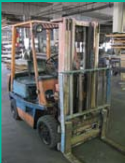
TOYOTA 4000LB LPG FORKLIFT