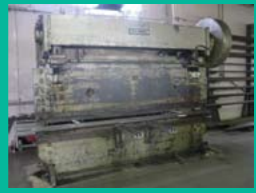
COLUMBIA 12FT x 100 TON PRESS BRAKE