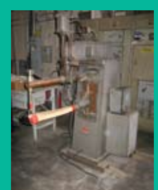
AMES 50KVA SPOT WELDER