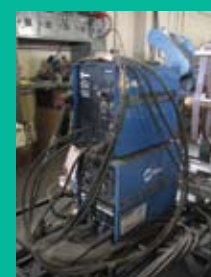
MILLER XMT 300 MIG WELDER