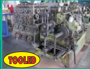
3 ANGLE ROLLS