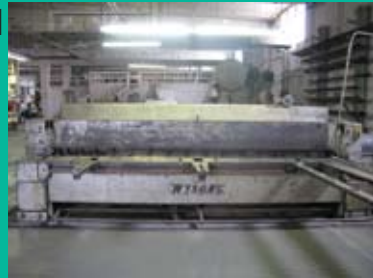
WYSONG 12FT x 1/4" POWER SHEAR