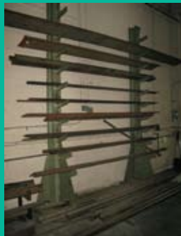
PARTIAL VIEW OF FORMING DIES