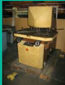
HYDRAULIC CORNER NOTCHER, 8" x .25" CAP