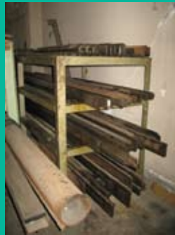
PARTIAL VIEW OF FORMING DIES