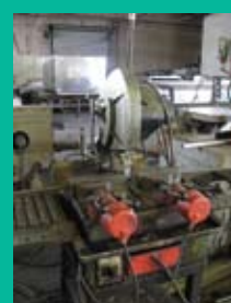
BROBO 14" COLD SAW